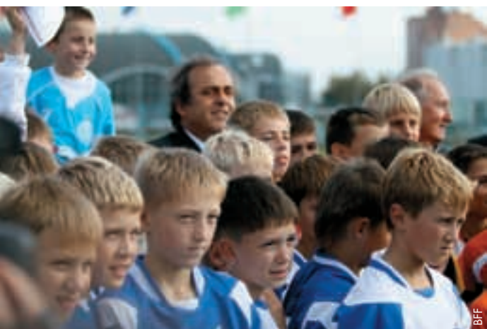
Michel Platini with a group of young footballers

The celebrations continued in September when a week of grassroots football and a FIFA grassroots seminar were organised in Belarus. During the week, football instructors from all over the country were taught the key principles of grassroots football and how to organise football festivals for kids. They were given an opportunity to apply what they had learnt under the watchful eyes of experienced instructors from FIFA and the Football Federation of Belarus (BFF) when several festivals were organised in Minsk and other regions of the country. This has helped to enlarge the family of grassroots football instructors in Belarus.