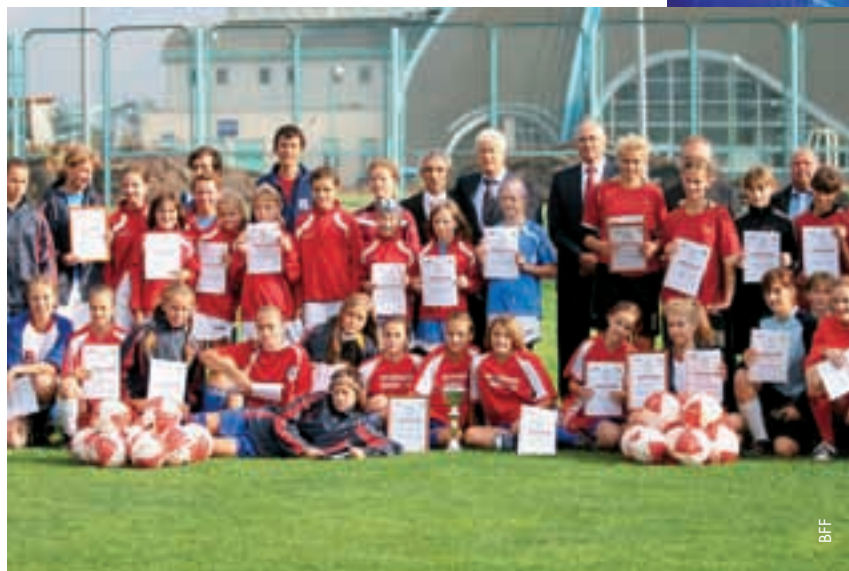
The youth tournament participants, happy and proud