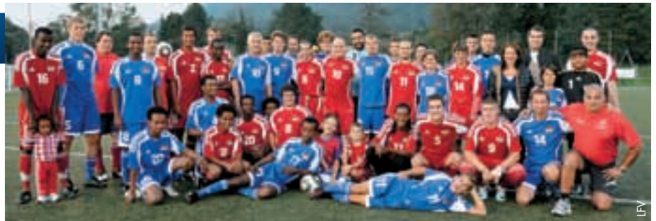
A friendly match for peace

The organisers were once again delighted with the all-round success of the event, which