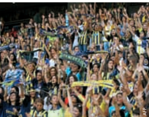
Women and children fill Turkey's stadiums

The executive committee of the Turkish Football Federation (TFF) decided in September that women and under-16s should