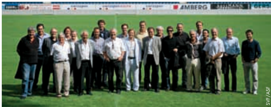
The ex-internationals at the home of FC Luzern

For years the Swiss Football Association (SFV-ASF) has organised an annual day trip for its former national team players. It is a hugely popular tradition and a great opportunity for ex-internationals to get together and share stories and experiences.