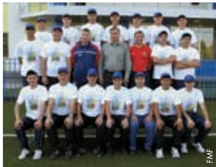
The instructors and C-licence students

The FA of Moldova is continuing its work to improve the level of local coaching in the country. Recently, at the CSCT Buiucani stadium in Chisinau, the association launched its 16th UEFA C-licence course.