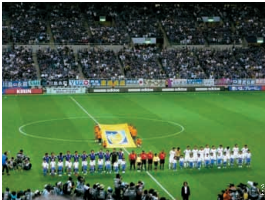
Japan v North Korea, a lesson in respect