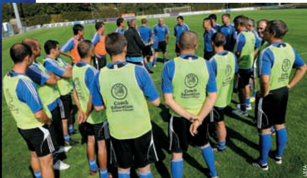
Theory time for the Pro-licence students

Three similar events have also been written into UEFA's fixture list for the 2011/12 season. ●