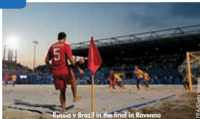
Russia v Brazil in the final in Ravenna

The European contingent was completed by Ukraine, who took Brazil all the way to penalties in the group stage, and by Switzerland. ●