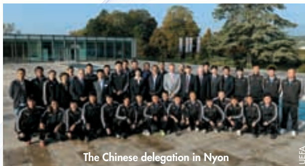
The Chinese delegation in Nyon

As part of the EU-China Year of Youth, UEFA has launched a training programme for young Chinese coaches in cooperation with the European Commission.