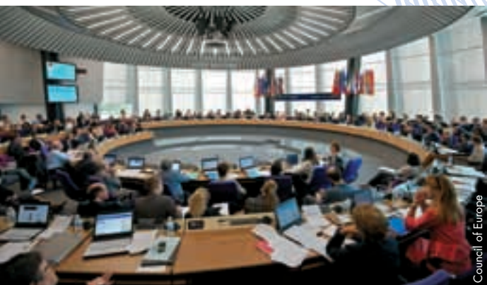
Council of Europe

"You can be sure that we will not make any compromises with hooliganism and we will redouble our efforts to kick violence out of our stadiums, to eliminate it. Notice, I did not say reduce, limit or contain – I said 'eliminate' it. I believe it is possible to eliminate violence in our stadiums. Legislators and governments must, in any case, think about it constantly and relentlessly; in matters such as this, as long as everything possible has not been done, our duty has not been fulfilled."