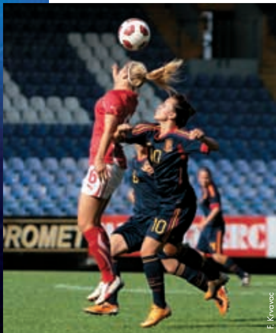
Spain v Switzerland in the women's U19 mini-tournament hosted by Bosnia and Herzegovina. Both won a place in the second qualifying round.