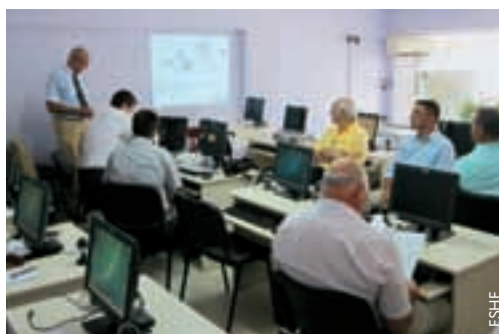
Training sessions are being organised to introduce users to the new system

Another possibility the system has created is for referees, delegates and