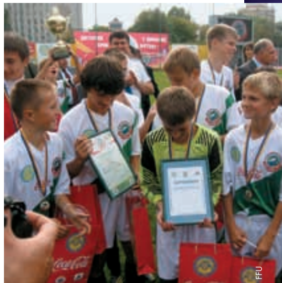
Certificates and prizes for the Leather Ball participants

In accordance with the tournament regulations, the winners of eight zonal groups entered the final tournament, which took place in Kyiv on the fields of the national training complex named after first FFU president, Viktor Bannikov. For the group stage these eight teams were divided into two groups of four. The group winners contested the final, while the two second-placed teams competed for bronze medals.