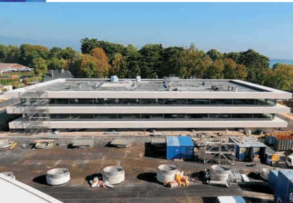
As of next spring, UEFA's new office building, Bois-Bougy, will house 190 UEFA staff

decided to extend the convention funding from 2012 to 2016. For the new period, therefore, more than €21 million will be earmarked for refereeing, a total that includes an annual contribution of €100,000 for each full convention member (€75,000 for the partial member) and a bonus of €100,000 for new members.