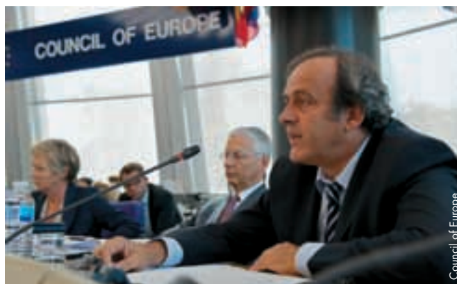
The UEFA president addresses the Council of Europe

He pointed out that match fixing was orchestrated by criminal organisations but still many European states did not cover the offence in their criminal legislation. As he