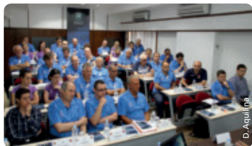
A fruitful knowledge-sharing exercise involving representatives of four national associations

Recently, the Malta Football Association hosted a UEFA Study Group Scheme seminar on grassroots football. Participants from another three UEFA member associations – Italy, Lithuania and Luxembourg – joined the Malta FA's representatives to exchange knowledge of a technical nature on grassroots football and coach education at this level, besides other related subjects. Experiences in these