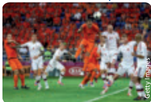
Netherlands – Denmark