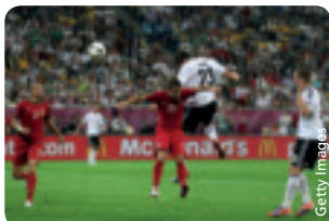
Germany – Portugal