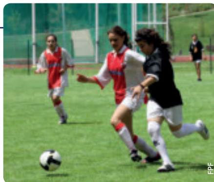
The women's football festival contributed to the rise in the sport's popularity