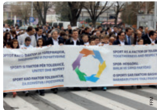
Sport as a vehicle of tolerance and respect

Under the patronage of the president of the Former Yugoslav Republic of Macedonia, Gjorge Ivanov, and in partnership with the global geostrategic institute, the Football Federation of Macedonia (FFM) has organised grassroots events in six regions for participants from different ethnic backgrounds as part of a project promoting sport as an agent of tolerance, togetherness and respect.