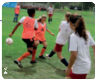
Women's youth football at the Ramat Gan stadium

In addition to the regular women's leagues, the IFA is organising open tournaments for the