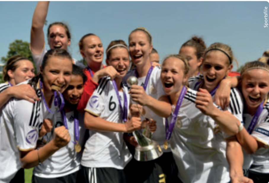
Germany's women's U17 team rediscovered their winning formula after a gap of two years

Having dominated the first two editions of the competition, Germany won back the European U17 title that Spain had won and defended in the past two years.