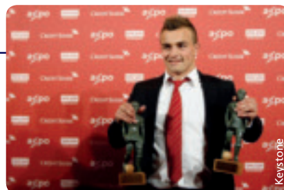
Two awards for Xherdan Shaqiri

The goal of the year award went to Xherdan Shaqiri for the bicycle kick that put FC Basel 1-0 up away to FC Luzern. And Heiko Vogel more or