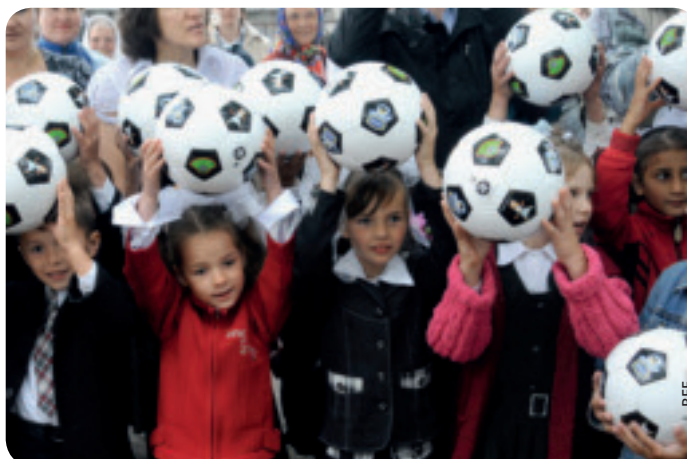
Footballs by the thousand for young schoolchildren in Belarus