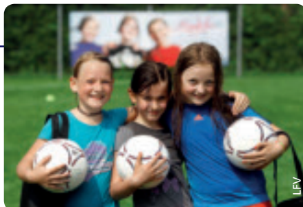
A training session to show how much fun football can be

To the organisers' delight, the girls came in numbers. No fewer than 82 were curious to