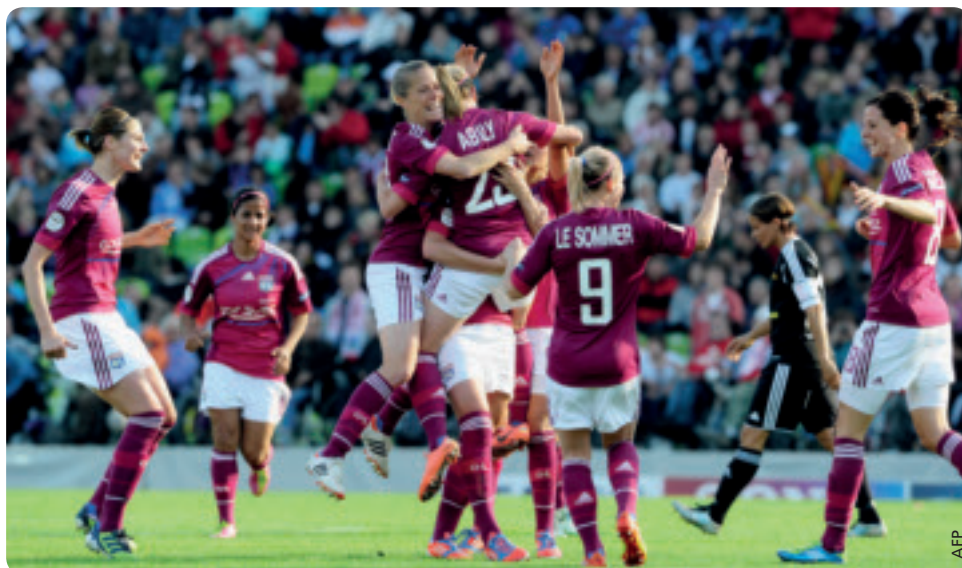
Olympique Lyonnais celebrate defending their title