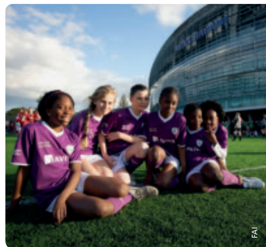
Discovering football in the shadow of the national stadium