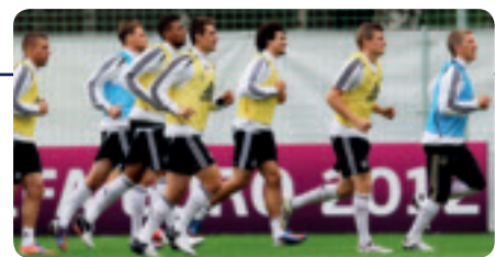
The new app allows users to follow all the activities of the German national team

Fans of German football can now get updates wherever and whenever they want. With up-to-the-minute news, exciting minute-by-minute commentaries and an exclusive video section, everyone can keep their fingers on the pulse with the very latest text and video information.