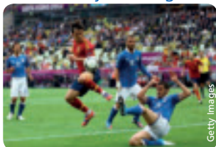
Spain – Italy