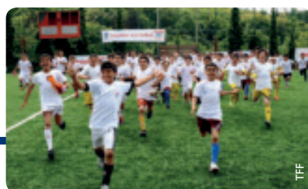
A fun-filled atmosphere at the national youth and sports day