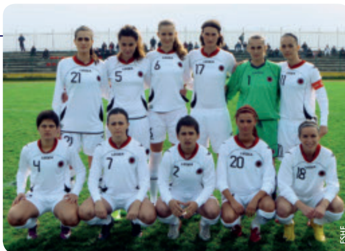
The Albanian women's national team has yet to taste defeat

Recently, he led the women's national team during a ten-day retreat accompanied by friendly matches. The purpose of this retreat was to put the players in a tournament situation. So they were given the chance to be selected for and play three matches in a