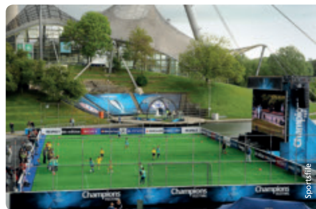
The UEFA Champions Festival in the Olympiapark