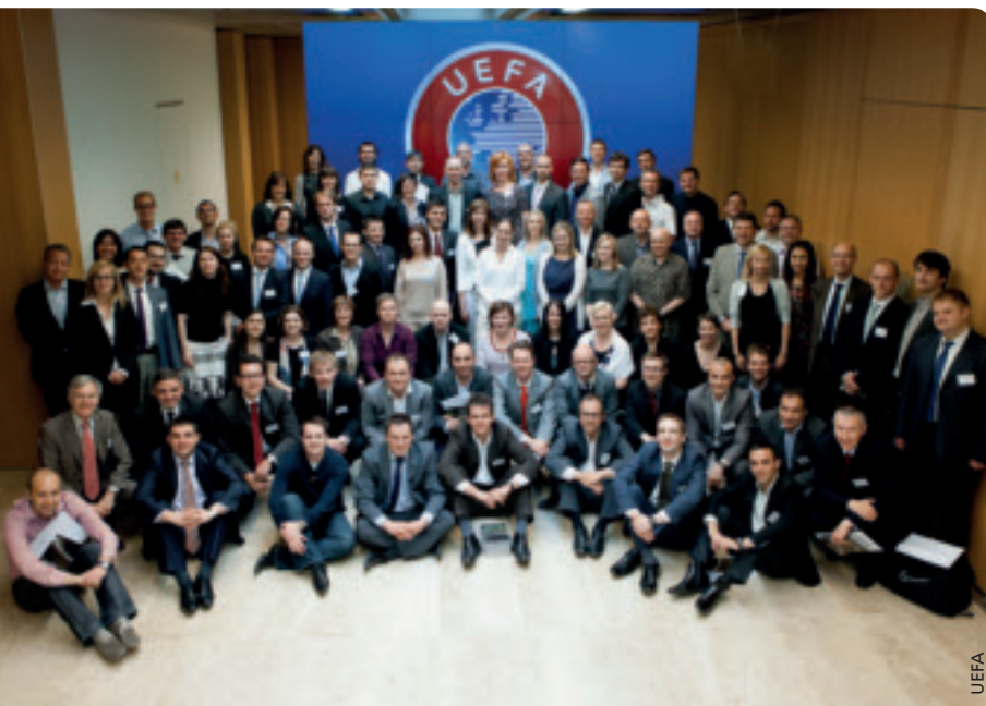
The graduates gather at UEFA headquarters in Nyon

In a ceremony at the House of European Football in Nyon on 11 May, more than 70 graduates from throughout Europe – including many from national football associations – received the UEFA Certificate in Football Management (UEFA CFM) and UEFA Diploma in Football Management (UEFA DFM), following the completion of nine-month courses.