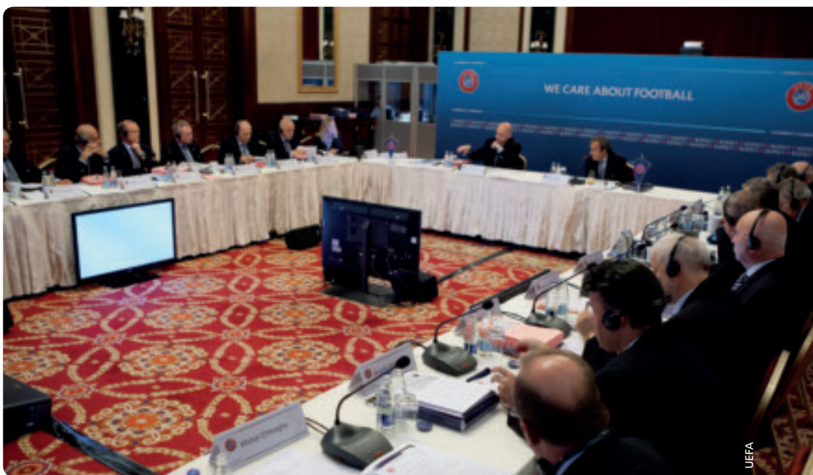
A busy agenda for the Executive Committee at its meeting in Kyiv

The UEFA Super Cup is leaving Monaco and will be held in Prague on 30 August 2013. This will be the first leg of a journey which will take it to the Cardiff City Stadium (26,650 capacity) in 2014 and the Mikheil Meskhi Stadium in Tbilisi (24,600) in 2015.