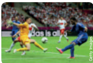
Poland – Greece