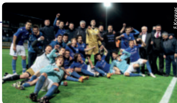
A brilliant season for FK Željeznik

But this season was all about FK Željeznik and their record. The club has now won the championship five times (1998, 2001, 2002, 2010 and 2012). They also won once in the