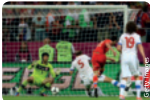
Russia – Czech Republic