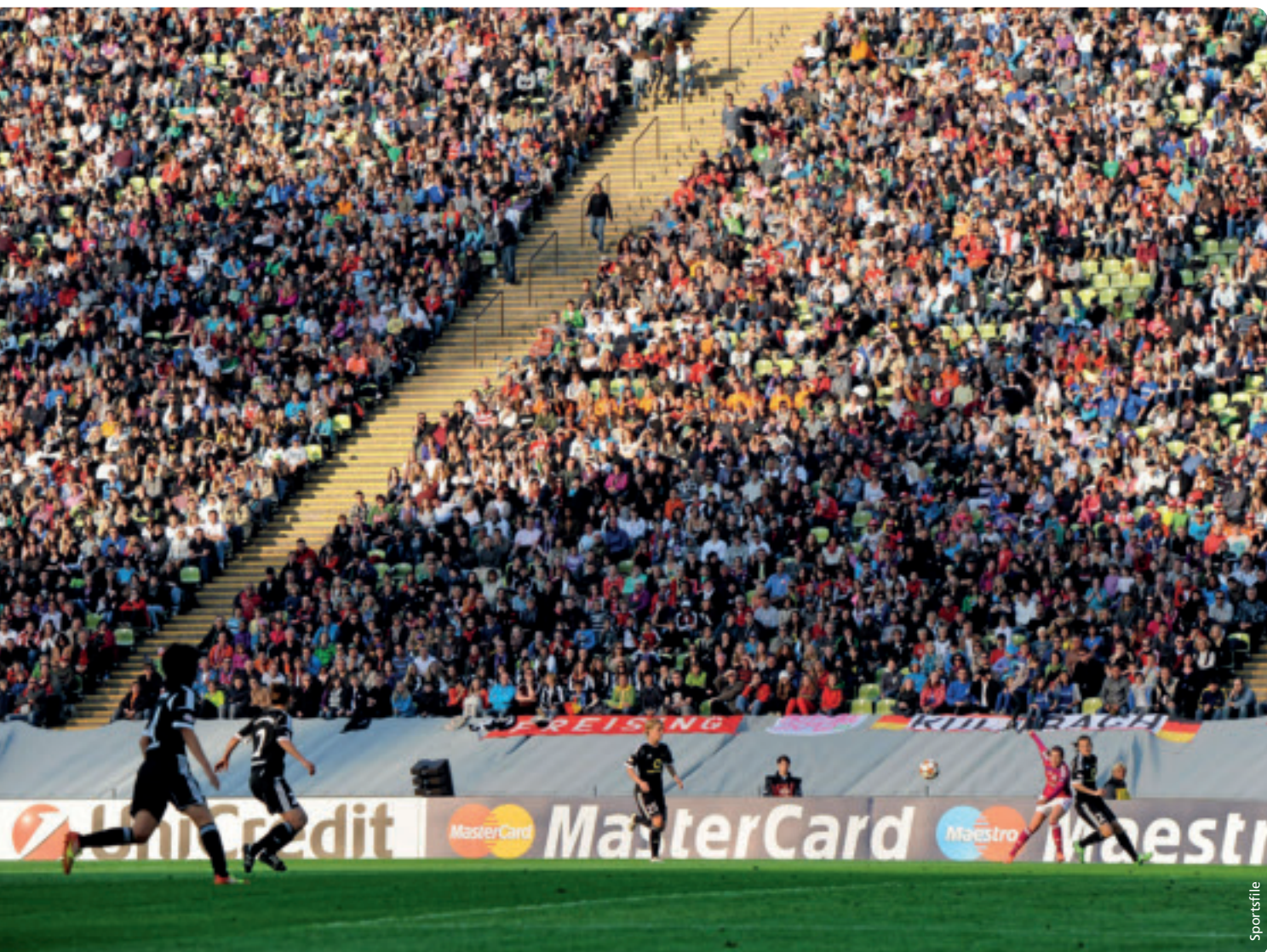
A record attendance (50,212 spectators) for the UEFA Women's Champions League final at Munich's Olympiastadion

The roots of women's football can be traced as far back as 1885. We do not know much about those early times, but the first women's international match on record was played between England and France in 1920 and watched by an incredible 25,000 spectators.