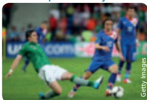
Republic of Ireland – Croatia