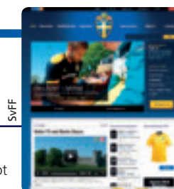
The new face of the Swedish FA website

Further web developments will take place to set up a Swedish football intranet that will combine the existing administrative system for all competitions (fogis.se) with the intranet benefits