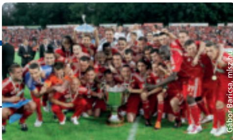
A league and cup double for VSC Debreceni