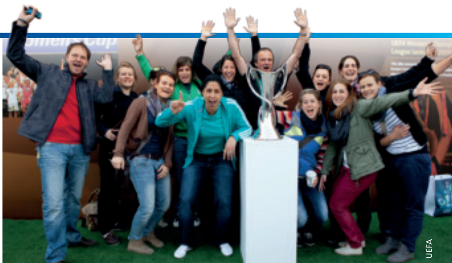
Steffi Jones, UEFA ambassador for the women's final in Munich, next to the UEFA Women's Champions League trophy and surrounded by a group of visitors to the UEFA Champions Festival

In 2001, the next milestone was achieved with the launch of the first UEFA Women's Cup. This heralded the introduction of women's club competitions, with 33 clubs qualifying initially. Enjoying considerable success, the Women's Cup ran from 2001 to 2009 before the UEFA Women's Champions League was launched to kick off the 2009/10 season. Not only did this new development position the women's game alongside the prestigious UEFA Champions League competition, it also showcased advanced, attacking and technically skilled women's football – defining it as a game on its own merit. ●