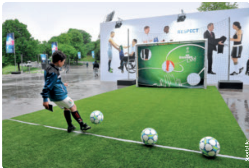
Shooting practice in Munich on UEFA Grassroots Day

This year, the UEFA Grassroots Day – an initiative launched in 2010 – was celebrated on 16 May, with events organised across Europe to mark the occasion.