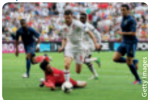
France – England