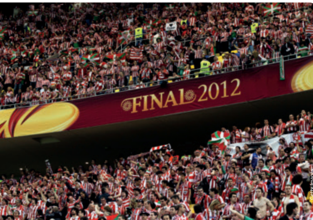
Packed stands for the first club competition final in Bucharest

Like the UEFA Champions League, the UEFA Europa League has just completed the third year of a three-year cycle. The total sum of more than €150 million distributed to the 56 participating clubs was therefore the same as in the previous season. Two clubs received more than €10 million.