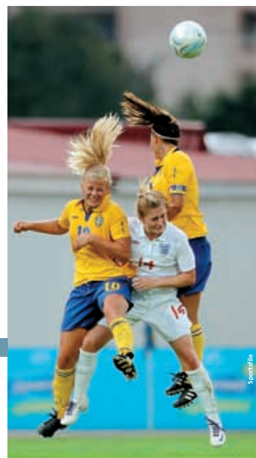
Sweden v England in the Women's EURO 2009, which was the subject of a medical study

UEFA's injury study conducted in Finland provided positive information in that the tournament registered a clear trend towards lower incidences