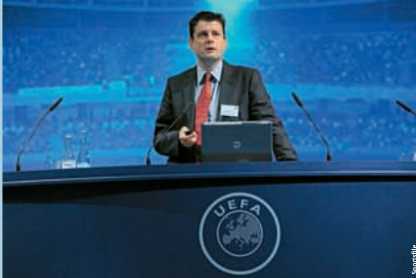
Prof. Mats Börjesson, member of the Swedish FA's medical committee

of exposure and, in a squad of 25, the medical team can be expected to encounter one every three seasons. Within the context of rarity, it's interesting to note that the risk of this type of injury is double during pre-season.