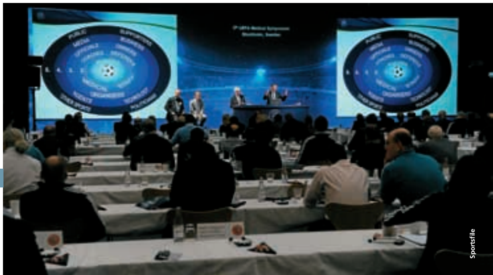
The medical symposium in Stockholm

It can be argued that the job description of the head coach of a modern professional football team can be compared to the CEO of a business, who commands overall responsibility for a company's operations. Sir Alex Ferguson puts his longevity down to developing management skills as much in common with running large companies as with work on the football pitch. He is no longer the one-man band who did everything. With a hundred players and staff under his control, he has become a master of overseeing a giant operation at a club valued at £1 billion.