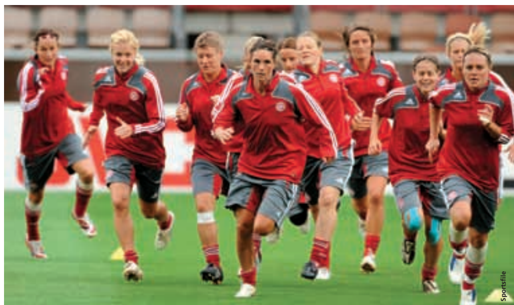
The Danish women's team in training during the Women's EURO 2009

Bearing in mind that Germany is at the top of the women's ladder, the advice is of special interest to national associations on the rungs below them, where girls may be starting to play their football at later ages, and where doctors have a role to play in helping them to avoid the physical pitfalls which, in recent years, have become apparent in the women's game.