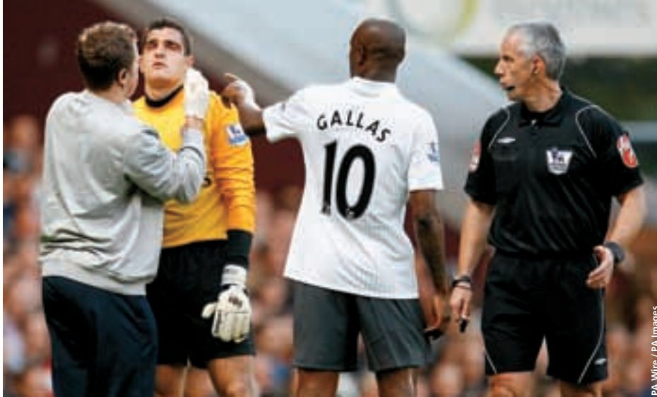
Arsenal's goalkeeper Vito Mannone receives treatment on the field during a Premier League match against West Ham.