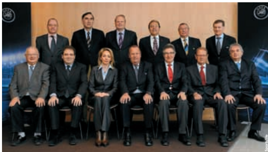
The UEFA Medical Committee