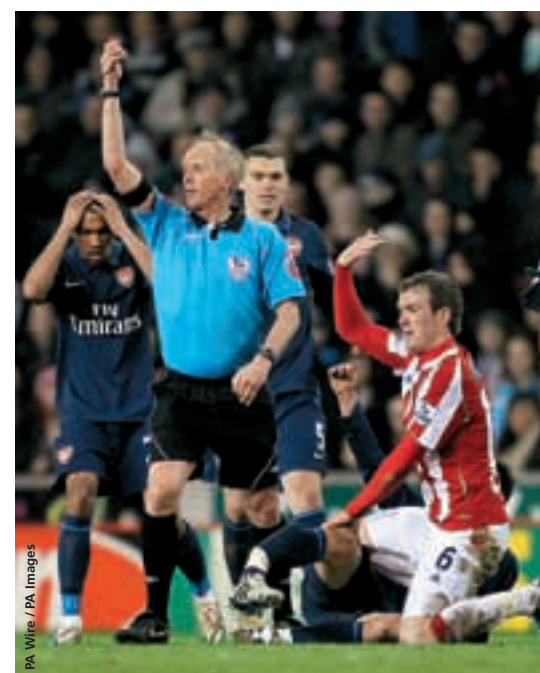
If the injury looks serious, the referee allows the doctor onto the field.

There are many ways in which a referee can safeguard the health of the players and contribute to the quality of medical care for an injured player. The default position should be that Law 18, 'the law of common sense', should prevail and that referees, in partnership with the medical staff, should always act in the best interests of the players and ensure that prompt medical attention is permitted and administered.