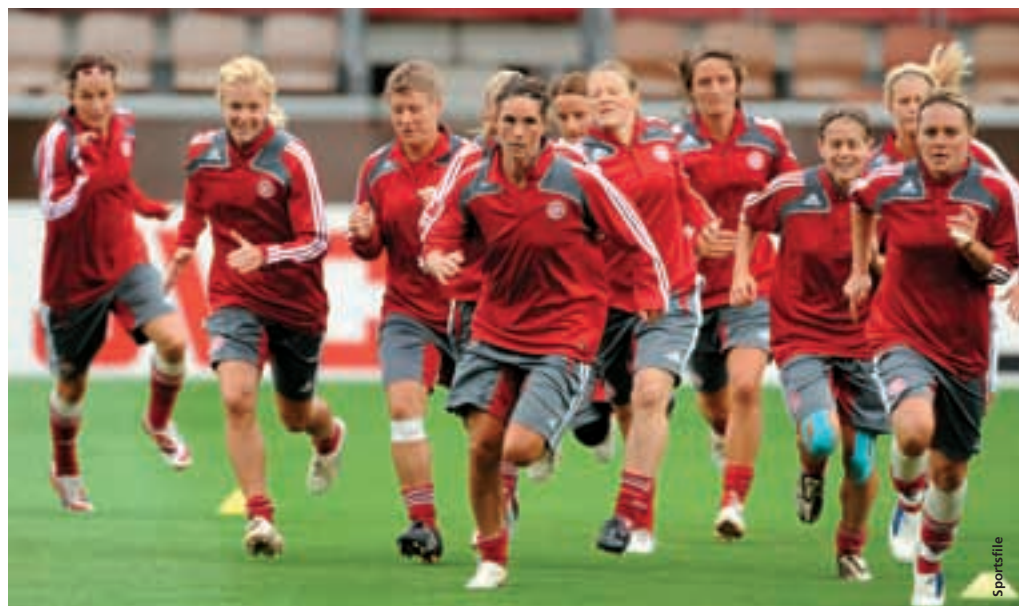
The Danish women's team in training during the Women's EURO 2009

Bearing in mind that Germany is at the top of the women's ladder, the advice is of special interest to national associations on the rungs below them, where girls may be starting to play their football at later ages, and where doctors have a role to play in helping them to avoid the physical pitfalls which, in recent years, have become apparent in the women's game.