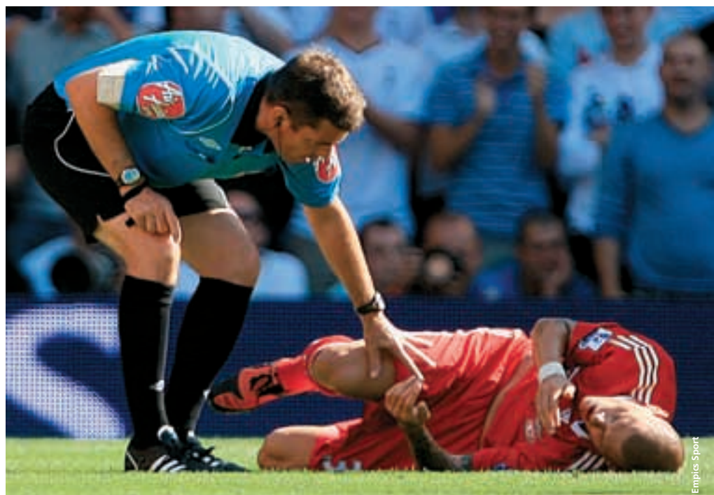
It is up to the referee to judge how serious an injury is and to act accordingly.

These are such a rare occurrence that clubs asked UEFA to collate data which could be used to draw comparisons and offer pointers towards best practice. The incidence in elite male football is 0.04 stress fractures per 1,000 hours