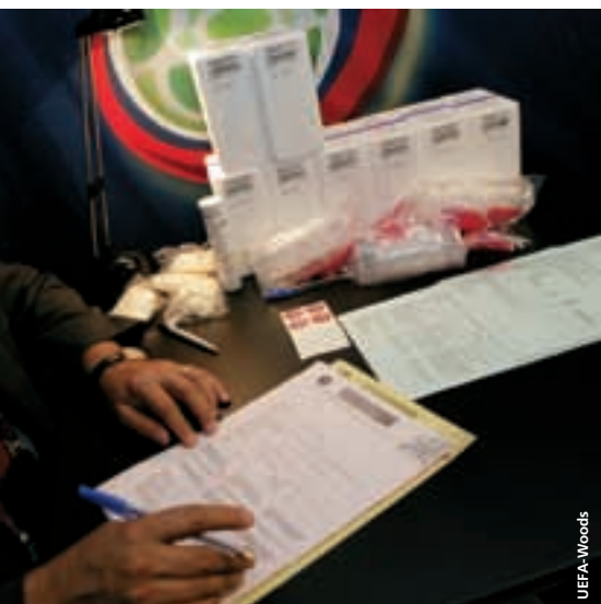
The equipment for a doping control

Out-of-competition testing also produces some logistical hiccups, largely related to the implementation of the 'whereabouts' ruling. Let's imagine the two doping control officers ringing the bell at the gates of a training ground, only to be told that, on the