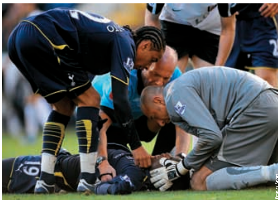
The referee checks to see how badly the player is injured.

There is widespread misunderstanding that an unconscious or concussed player may have 'swallowed his tongue' and must be immediately moved into the 'recovery position'