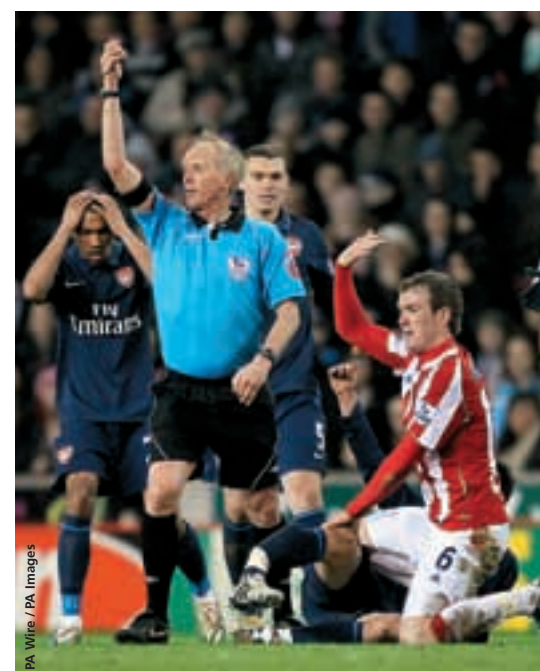
If the injury looks serious, the referee allows the doctor onto the field.

There are many ways in which a referee can safeguard the health of the players and contribute to the quality of medical care for an injured player. The default position should be that Law 18, 'the law of common sense', should prevail and that referees, in partnership with the medical staff, should always act in the best interests of the players and ensure that prompt medical attention is permitted and administered.