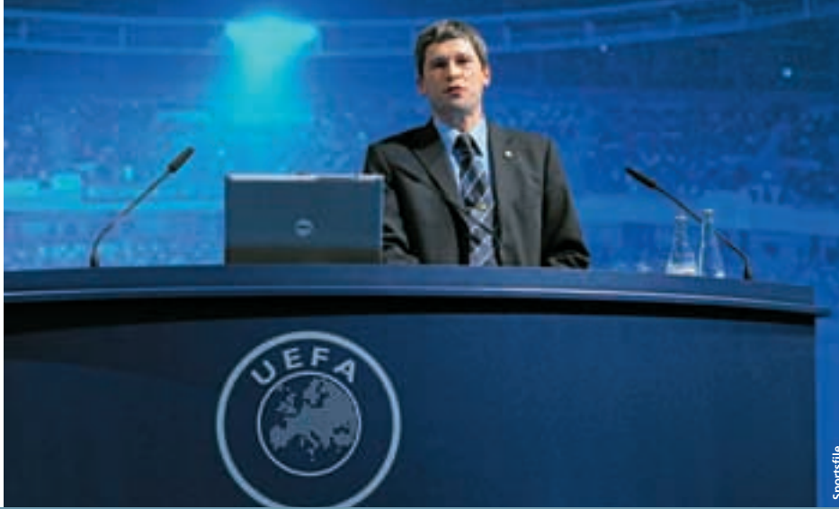
Former referee Markus Merk was on hand to present the referees' point of view.