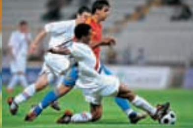
The semi-finals pitted France against Turkey (far left) and the Netherlands against Spain.