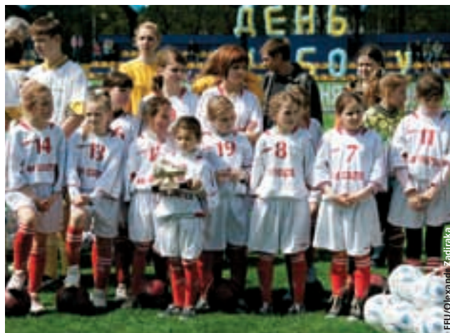
Football Day, a day packed with activities for children.

on competitions for children and young people. A street football tournament in a small Sevastopol street attracted no less than 143 teams, for example. A lot of matches involving women, veterans, disabled players, beach soccer players and futsal players took place too. ■