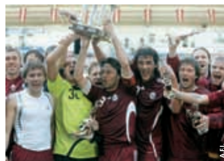
The Latvian team celebrate their success.

Furthermore, the Latvian Football Federation has published a book of LMT Virsliga teams for the 2008 season. Complete with all the team and player photos, official names, championship statistics and historical information, the book is available from the LFF's partner shop, www.fansworld.eu . ■