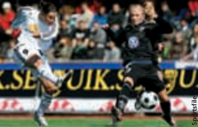
Germany's Birgit Prinz gives it her all in the first leg of the final.