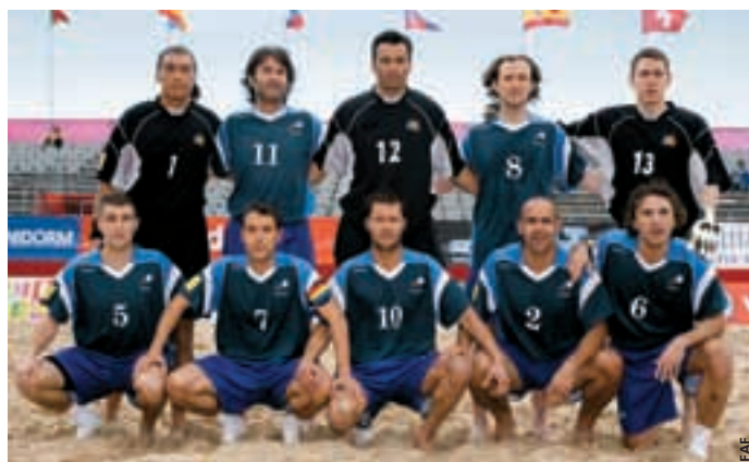
The Andorran beach soccer team.

ing level and in terms of the experience as a whole. It will therefore continue its efforts to ensure that this year's participation is the first of many. ■