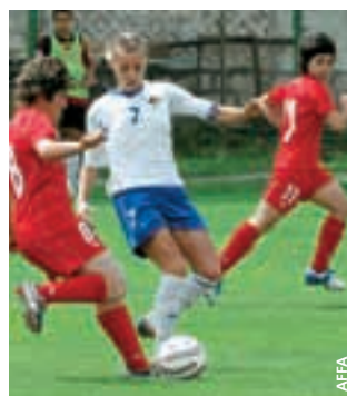
Azerbaijan (in white) won the women's tournament organised with UEFA's support.

women's national team also beat Georgia (3-0) and Lithuania (2-1) along the way. After the match against FYR Macedonia, the AZFA general secretary met the players and congratulated them on their win. ■