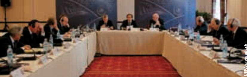
The UEFA Executive Committee meeting in Moscow.