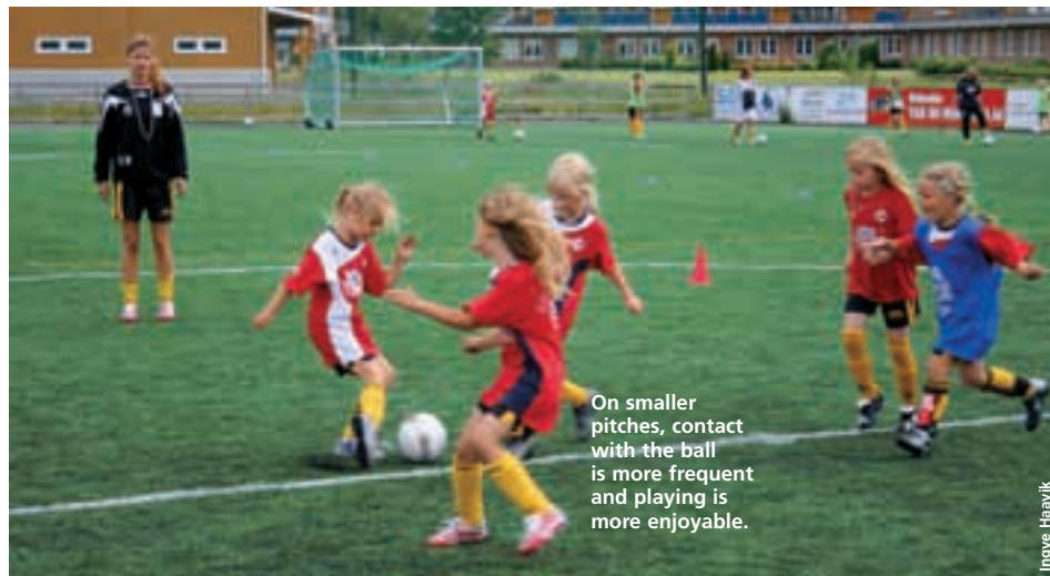
On smaller pitches, contact with the ball is more frequent and playing is more enjoyable.

The NFF offers various courses for grassroots football coaches so that children both can have fun and improve their game. But given that there will always be coaches who do not attend courses, the articles on the homepage give coaches simple guidelines on how to organise training sessions. One of the main objectives has been to provide the coaches with tools for training big groups. To improve the children's football skills, they have to have as much contact with the ball as possible. A key way of achieving this is to divide the training ground into several small pitches for small-sided games which are both fun and instructive at the same time. ■