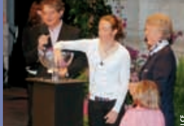
The draw in Blois.

73. Recommends that Member States and national sports federations and leagues introduce collective selling of media rights (where this is not already the case); considers that there needs to be, in the interests of solidarity, an equitable redistribution of income between sports clubs (...) and between professional and amateur sport, so as to prevent a situation in which only big clubs benefit from media rights.