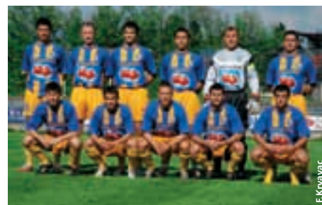
Modrica are the new champions of Bosnia-Herzegovina.

FK Modrica became the champions of Bosnia-Herzegovina for the first time in the club's history, beating NK Jedinstvo Bihac 3-0 on the last day. Modrica had topped the table halfway through the season and maintained their lead to the last. Four years ago they were Bosnia-Herzegovina cup winners, meaning they now join FK Zeljeznicar, FK Sarajevo and NK Siroki Brijeg as the fourth team to have taken both domestic trophies.