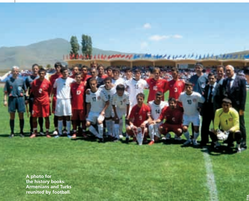
A photo for the history books: Armenians and Turks reunited by football.

Throughout the tournament, post-match press conferences and farewell dinner, representatives of the delegations and UEFA officials all praised the professional organisation and hospitality. ■