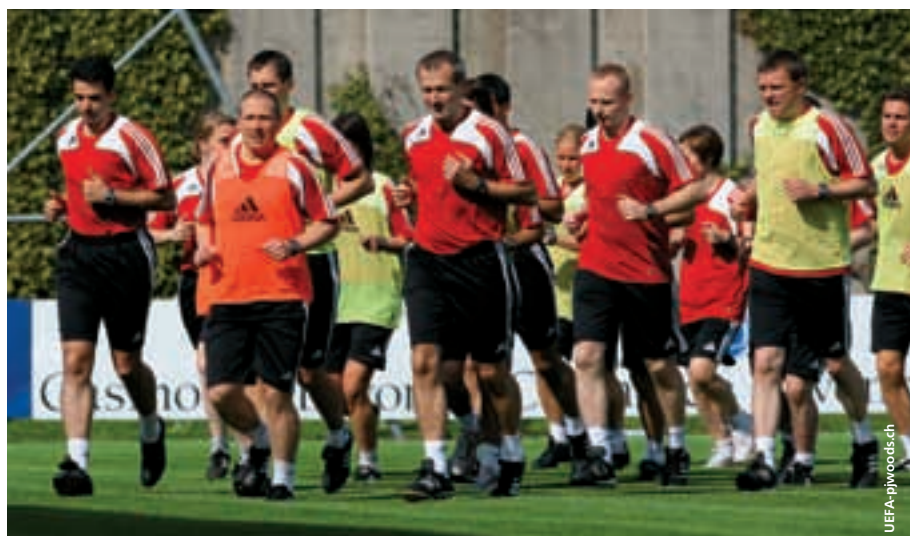
During courses and seminars, the referees never escape fitness training!

The eighth talents and mentors seminar was held at UEFA's headquarters in Nyon at the beginning of May. Just under 20 up-and-coming male referees, as well as four of their female colleagues, followed a varied programme of talks, discussions and a training session. Tactical match preparation, physical training programmes and mental preparation were all on the seminar agenda.