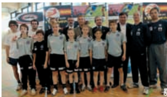
Gymnastics coaches for talented young footballers.

The ÖFB president welcomed the new cooperation project: "With this project, the Austrian Football Association and the Austrian Gymnastics Federation are forming a unique partnership for the benefit of the best young talent in the country. The work of the gymnastics coaches who are piloting the project in nine selected regional association training academies represents another step in the ÖFB's constant efforts to improve the training of young footballers. I am pleased that this cooperation between football and gym-