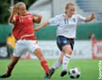
Denmark beat England for third place.