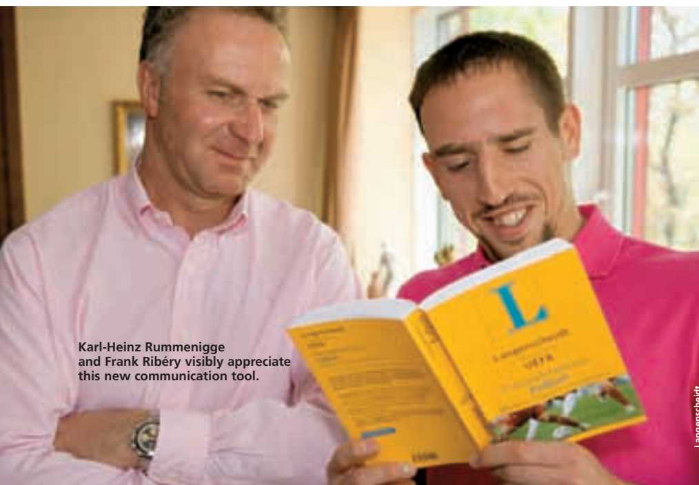
Karl-Heinz Rummenigge and Frank Ribéry visibly appreciate this new communication tool.

On account of its multilingual nature and the detailed information it contains, the dictionary can appeal to various target groups (coaches, players, delegates, translators, interpreters, football fans, etc.). UEFA hopes that it will help to overcome language barriers and to promote communication within the football family and the football-loving community as a whole.