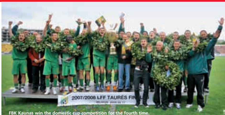
FBK Kaunas win the domestic cup competition for the fourth time.

It was FBK Kaunas's sixth appearance in the final. In 1998 and 1999 they were not triumphant, but they have made up