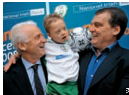
Giovanni Trapattoni and Marco Tardelli launch the summer schools' programme.

The National Irish Bank FAI Summer Soccer Schools provide deaf children with fun activities that provide encouragement for positive, healthy living. They are part of an initiative focused on participation rather than competition. The FAI will also hold three FAI Summer Soccer Schools this year with Down's Syndrome Ireland to encourage more children and adults with Down's Syndrome to participate in football and allow them to do so at their own level of ability. ■