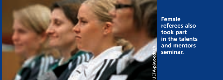
Female referees also took part in the talents and mentors seminar.

This European Championship will determine Europe's representatives for the Under-20 World Cup to be played in Egypt in 2009. The top three in each group will qualify.