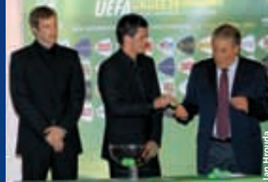
The draw in Prague.

In Moscow, the Executive Committee also chose FYR Macedonia to host the final round of the European Women's Under-19 Championship in 2010 and approved the regulations for the following competitions in the 2008/09 season: