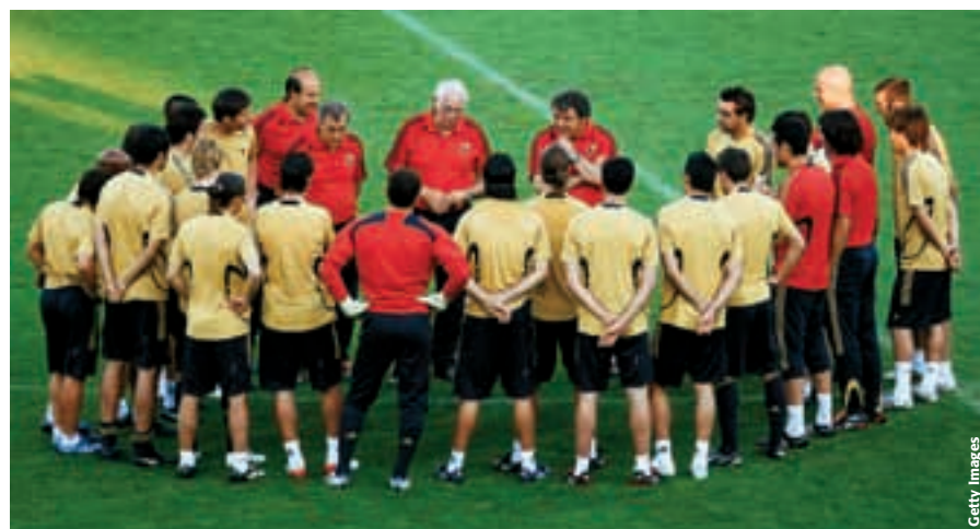
Spain's Luis Aragonés prepares his squad during EURO 2008.

The training process is largely hidden from the public gaze, but the results are there for all to see when the matches are played. The quality of football at EURO 2008 was ample proof that the technical teams did a great job in preparing their national squads for competitive action.