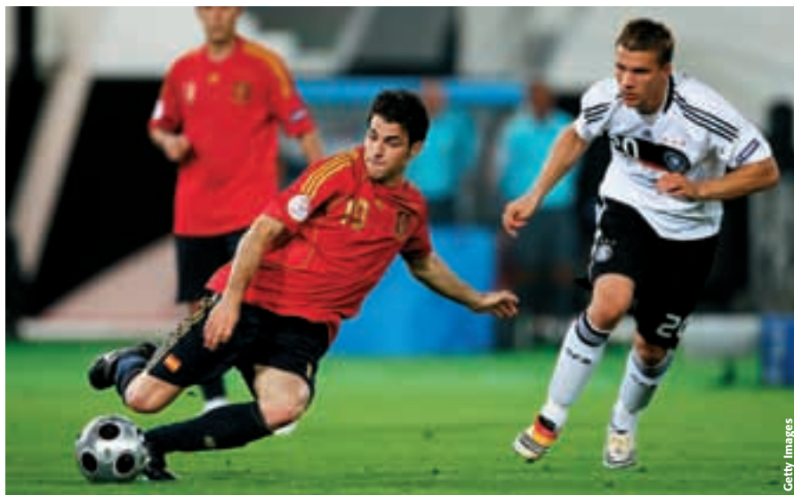
Cesc Fábregas is one of the many Spanish players to have blossomed in European youth competitions.

It doesn't happen that often. The example that springs to mind is Bojan Krkic, who immediately struck you as an extraordinary player. He had enormous qualities and it was obvious that he was capable of doing things that kids of his age don't usually do. The thing in this job is that you look to the future only to a certain extent – you focus on what the player is and it's up to you to imagine what he could be. But always taking his development step by step. So you tend to be cautious