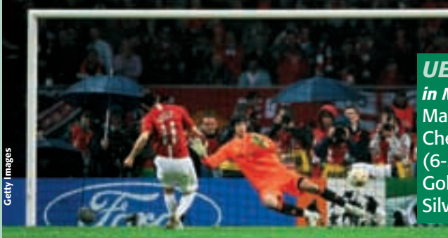
UEFA Champions League in Moscow Manchester United FC v Chelsea FC 1-1 after extra time (6-5 in penalty shootout) Gold: Sir Alex Ferguson Silver: Avram Grant