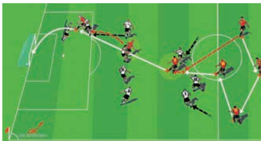
Xavi's incisive pass for Spain's winning goal in the EURO final.

The Dutch trained the way they played, and high intensity pressure and fast switching of play were emphasised in conditioned games during the preparation phase. They showed their readiness when they produced their sensational counterattacking moves against Italy in their first game in Berne. The Oranje players' willingness to support the fast breaks was already evident in training.