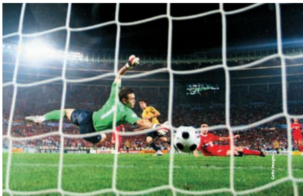
David Silva scores Spain’s third goal in their semi-final against Russia in Vienna.