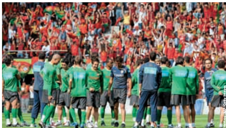
Portugal's public training sessions at the Maladière stadium in Neuchâtel were attended by more than 12,000 supporters.

THE 16 TEAMS WHICH TOOK PART IN EURO 2008 HAD TWO AND A HALF WEEKS TO PREPARE BEFORE THE OPENING MATCH. DURING THAT PERIOD A VARIETY OF METHODS WERE USED TO IMPROVE FITNESS (RECOVERY AND REGENERATION WAS PARTICULARLY IMPORTANT), TACTICAL KNOW-HOW, INDIVIDUAL TOUCH AND TEAM COORDINATION. SOME TEAMS ACTUALLY PERSONALISED PRE-TOURNAMENT TRAINING SCHEDULES BASED ON THE INDIVIDUAL PLAYERS' WORKLOAD DURING THE SEASON.