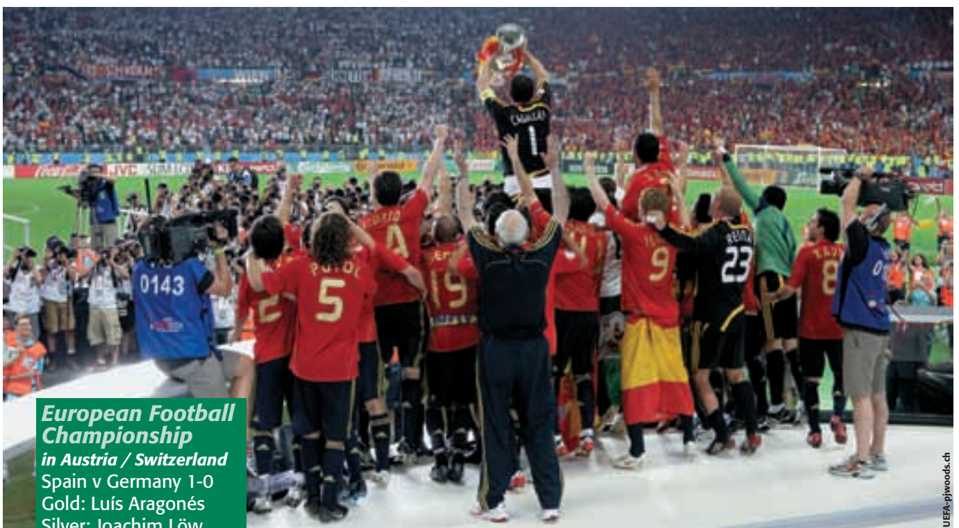
European Football Championship in Austria / Switzerland Spain v Germany 1-0 Gold: Luís Aragonés Silver: Joachim Löw

to his origins in the suburbs of Madrid. Is it coincidence that he received the European Championship baton from Otto Rehhagel, champion of Europe in Portugal at the age of 65? During EURO 2008, Arsène Wenger was invited to comment on the younger coaches who were performing in Austria and Switzerland. "It's the same as with players," he responded. "If you're good, you're good – no matter how young or inexperienced you might be. But at this level, it's an advantage to have experience. When you're young, after all, you're more likely to make mistakes. And at top level, mistakes can be costly."