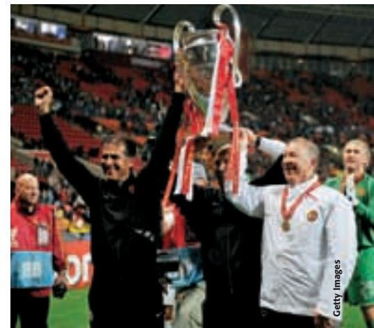
Sir Alex Ferguson's Manchester United promote an attacking style of football.

The aim in professional football is to win matches, but more and more the demands of the owners, the public and the media are to do it with style and panache. Just as in writing, where good prose provides the basic structure but poetry raises the text to a higher level of creativity, the game at the top level needs both effective, sensible organisation and, whenever possible, a commitment to skilful attacking play. The former coach of Real Madrid CF, Vanderlei Luxemburgo, stressed the attitude required when he declared to Brazilian coaching colleagues at a conference in Rio: "To be afraid of losing removes the willingness to win." EURO 2008 was a wonderful advert for the European game, with the successful sides blending passion for the cause, proficient team play and open attractive football. The aim is to win, but how the result is achieved has gained increasing significance in elite football's demanding environment. "I think all football lovers want people to make good combinations, to get into the penalty area and to score goals," said Spain's Luís Aragonés whose team captivated everyone with wonderful passing movements. The Spanish not only played fantastic football but they married it to results, and in doing so, set a performance standard for others in Europe to emulate.