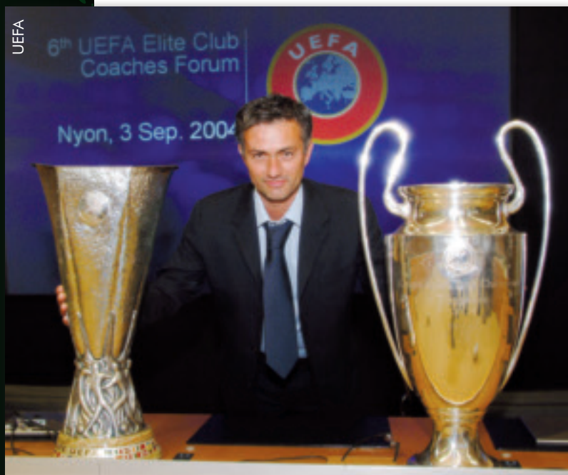
José Mourinho has won both major European club trophies, the UEFA Champions League and the UEFA Cup