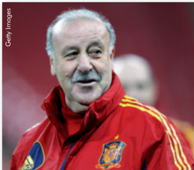
For Vicente del Bosque, a coach’s knowledge should go beyond just football

Vicente del Bosque (▼), Spain’s world champion coach, said at a UEFA coaches’ gathering: “If you only know football, you are lost.” Europe’s top coaches can easily relate to those words and to the sentiments of the jazz musician who once declared: “We play life.” Top