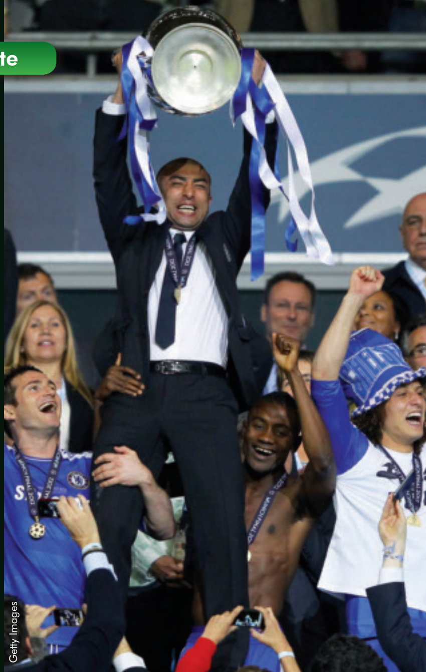
Roberto di Matteo and his players celebrate winning the UEFA Champions League trophy after their win against FC Bayern München