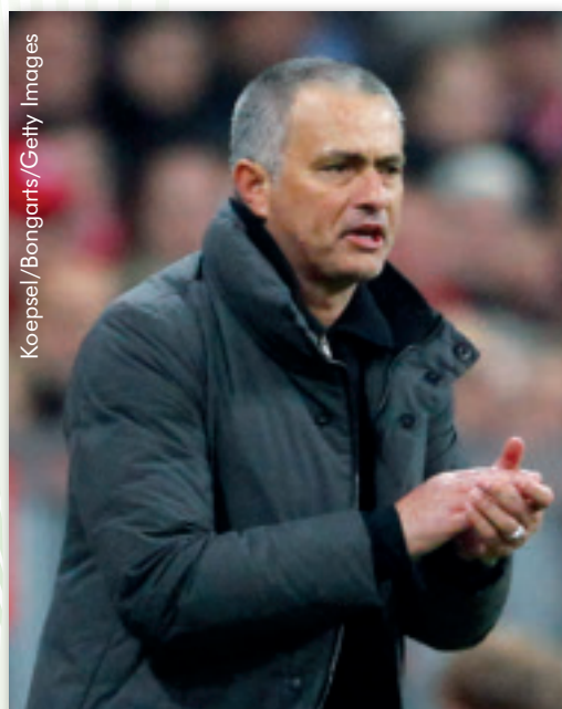
José Mourinho, now in charge of Real Madrid CF...

technicians José Mourinho, Sir Alex Ferguson and the others know football, but they also know about life – their training to reach the top of their profession has been, in José’s words, “fully comprehensive” . ●