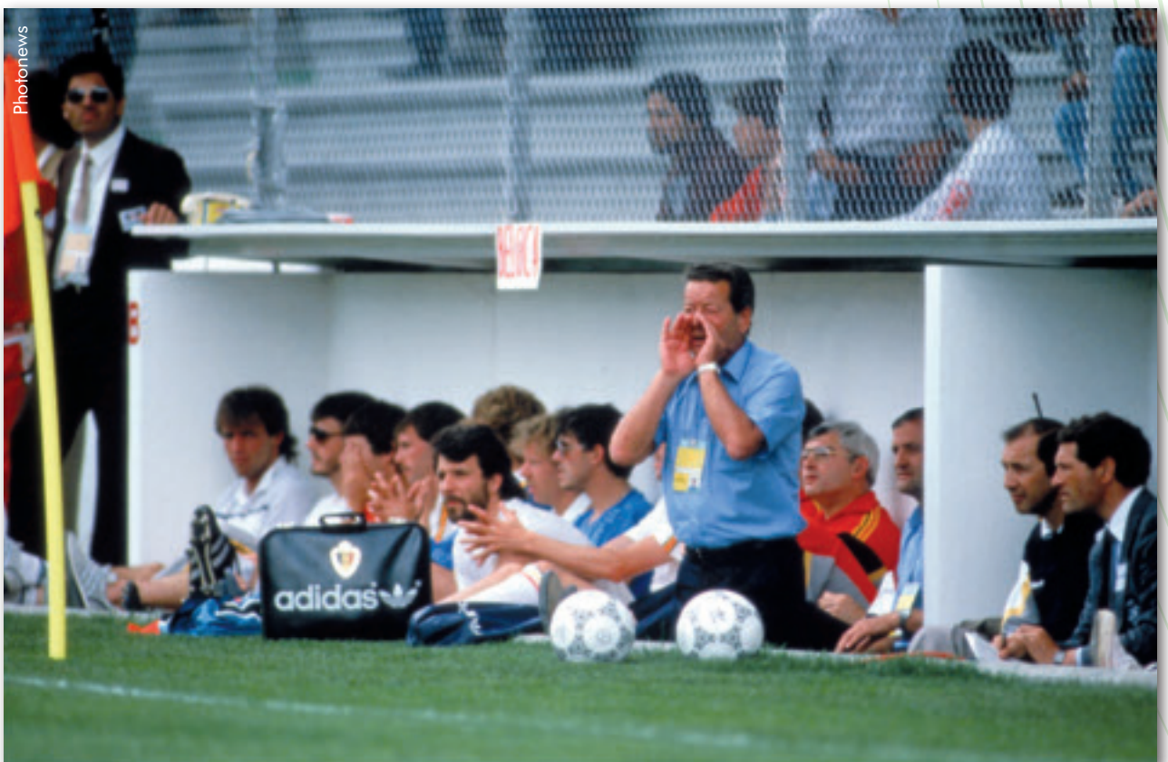
Guy Thys, head coach of Belgium during the 1986 FIFA World Cup in Mexico