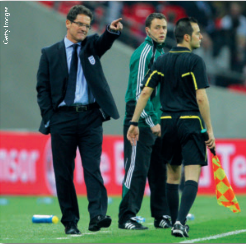
Fabio Capello underlines the great importance of coach education