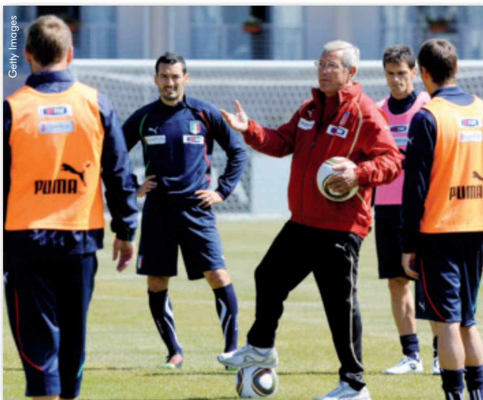
Marcello Lippi during a training session with the Italian national team