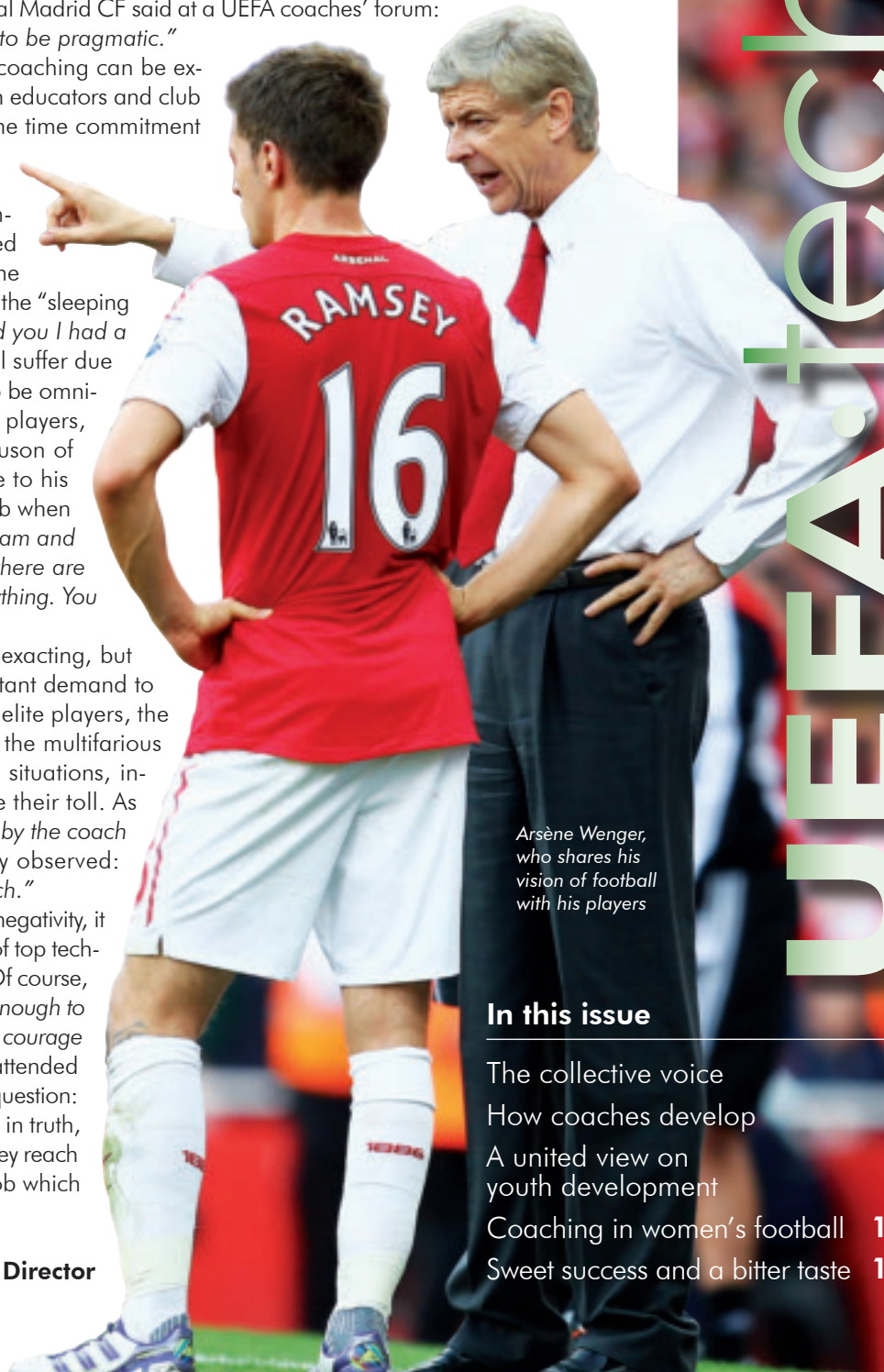
Arsène Wenger, who shares his vision of football with his players