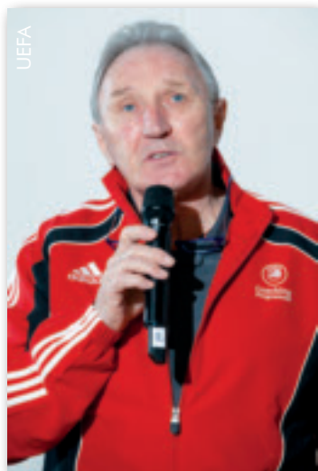
Howard Wilkinson, president of the League Managers Association in England

have had an average tenure of 0.85 years. However, the proportion of resignations has risen, whereas the number of dismissals has dropped. Of the 49 cases, 33 were dismissals and 16 resignations, with 9 of the latter motivated by a