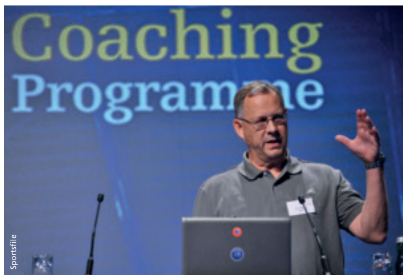
A member of the Jira Panel since 2004, Lars Lagerbäck – pictured here in Vienna in 2008 – has visited more than 25 countries in support of coach education.

I've been a coaching instructor since the end of the seventies – as a part-time job when I was coaching at a club. And I think the main reason the Swedish FA hired me was to be their coaching director. I have always liked coach education. There's also a selfish undertone because I learned aspects that were valuable to me in my coaching. Also, since I joined the Jira Panel in 2004, I've probably visited at least 25 countries in the context of coach education. That's good. Even if you don't learn many new things, it widens your perspectives, it keeps your mind tuned in and makes you ask yourself whether you're still doing things properly or whether you've forgotten certain aspects. So I've found that combining coaching with coach education is something that's very stimulating. It's like continual further