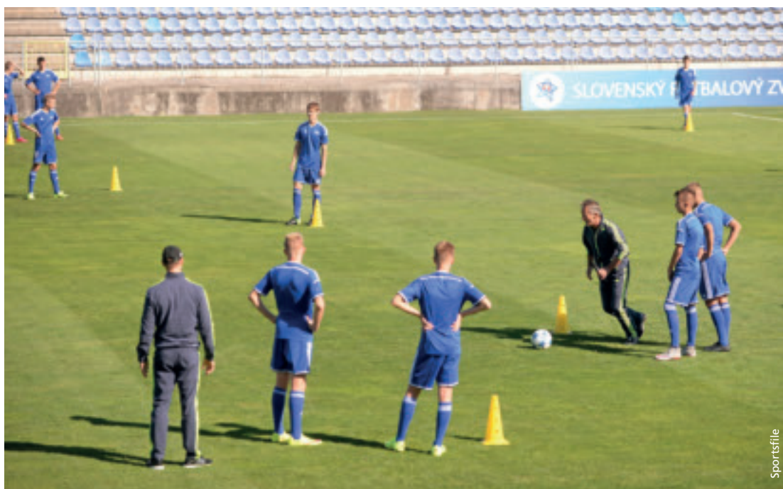
The sessions with the Slovak U15 and U18 teams underlined the need for a specialised approach to coaching at these age levels

Youth development was obviously a core feature of the recent UEFA Coach Education Workshop in Bratislava, which was all about ‘building for the future’. Indeed, all three days featured training sessions with youth players – the Slovak U15 and U18 teams to be precise – at the national association’s centre in Senec. They served to underline the need for a specialised approach to coaching at these critical age levels. This, in turn, highlighted the relevance of UEFA’s recently introduced Elite Youth A coaching licence.