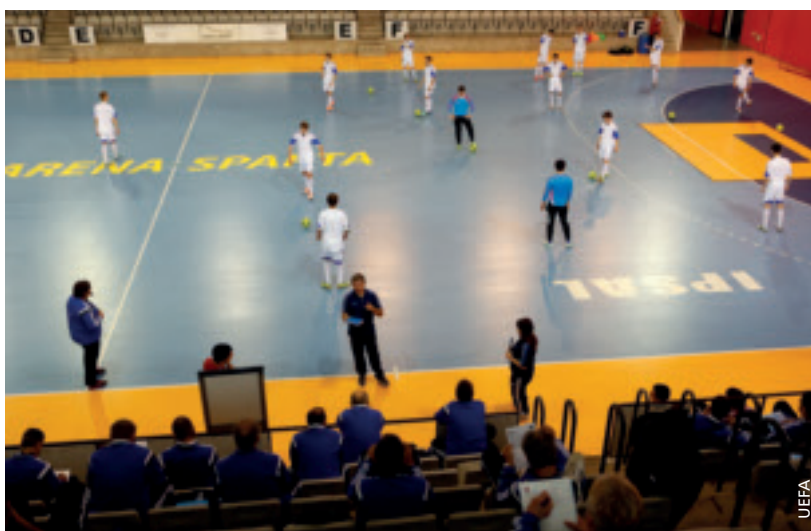
Participants in the stands listen to explanations from the coach during one of the practical sessions in Prague