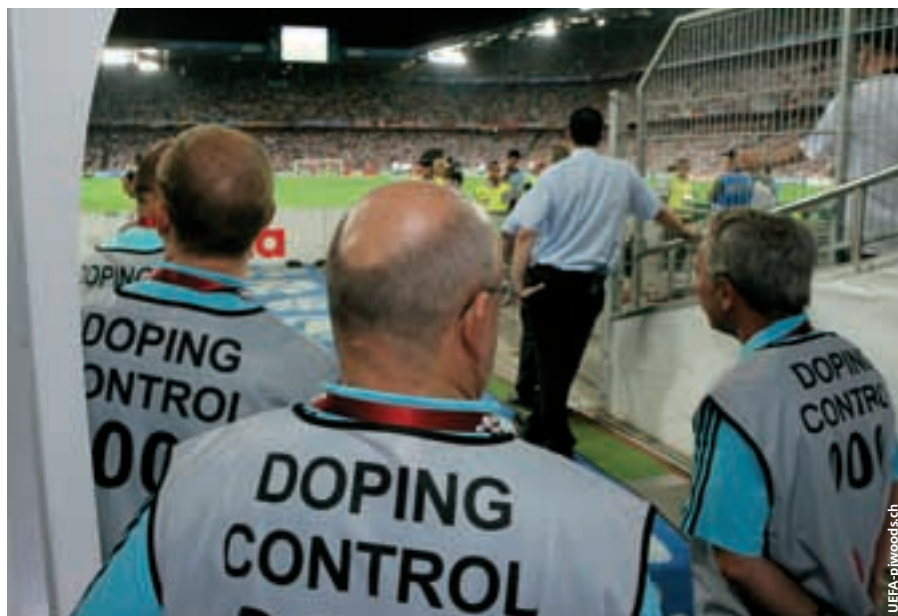
The doping control officers get ready to carry out their duties at the end of the match.

For further information or documents regarding UEFA's anti-doping programme, please click on the dedicated anti-doping section of uefa.com : http://www.uefa.com/uefa/keytopics/kind=1/index.html