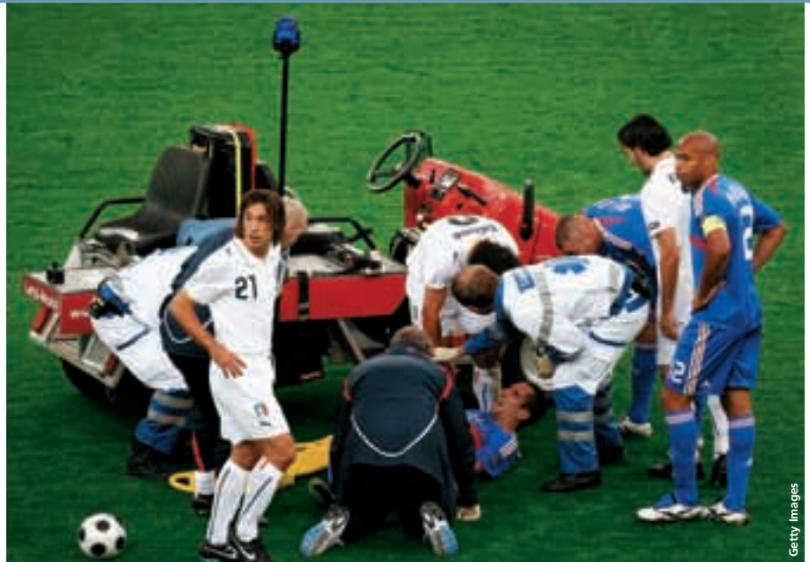
France's Frank Ribéry receives first aid on the field during the group match against Italy.

However, the risk of sustaining an injury during EURO matches has