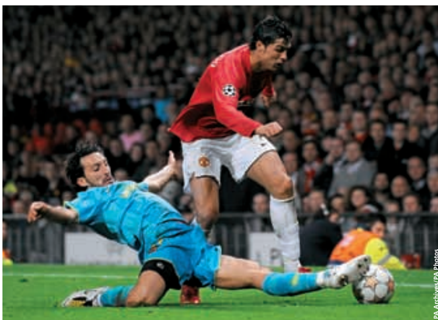
Barcelona and Manchester United took part in the 2007/08 UEFA Champions League injury study.

This report reflects the results from the full 2007/08 season (July 2007 to May 2008) with data from 14 par-