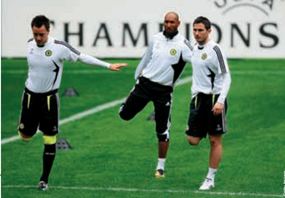
Chelsea's players stretch before their match against Fenerbahçe.