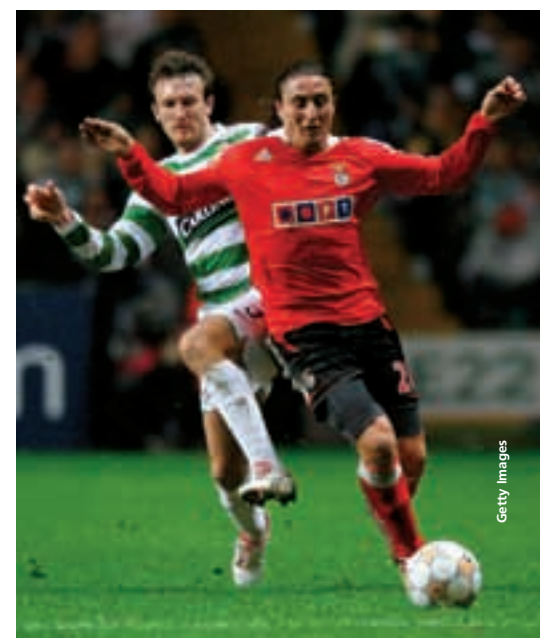
The risk of injury was revealed to be lower for clubs in southern Europe, such as Benfica.

As mentioned, the mean number of severe injuries in the UEFA Champions League (UCL) study is ten per season, each injury causing a mean absence of 75 days. The total absence due to these severe injuries in a team averages 750 days each season, representing about 10% of all exposure (meaning two players out of a squad of 25 constantly absent from training and matches due to these injuries).