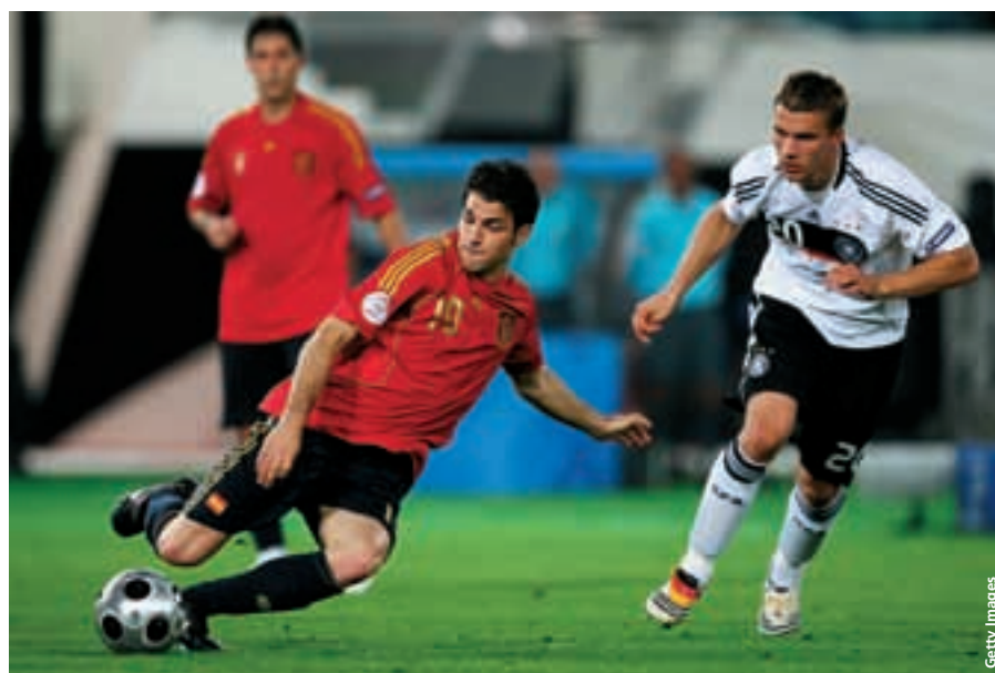
EURO 2008 was the subject of a thorough medical study.