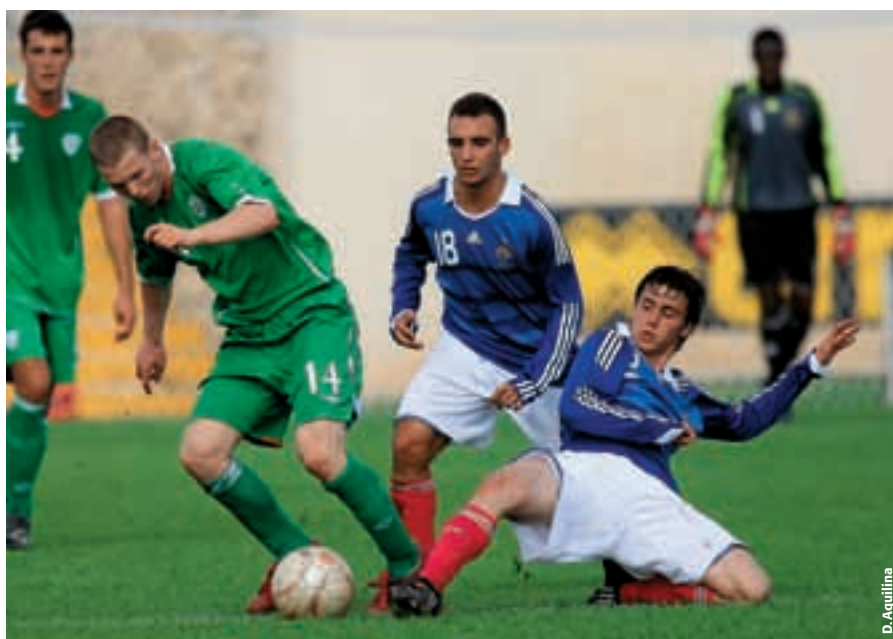
France v Republic of Ireland in a European Under-19 Championship qualifier.