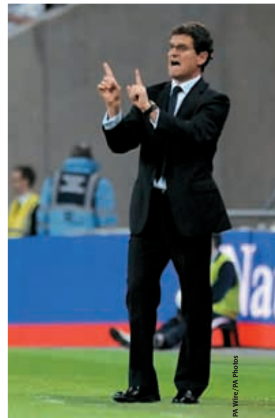
Fabio Capello in expressive mode in the technical zone.

By altering the text relating to the technical area, the IFAB has taken a common sense approach and shown respect for technicians and the role that they play in today's football. It has been a lengthy, sometimes painful, process for the coach's job and working conditions on the touchline to be acknowledged and recognised in a tangible way. The technical area, when used properly, adds an important, positive dimension to the game. We have come a long way since the introduction of the trainers' bench at Aberdeen FC – let's hope that the coach's new-found freedom will reduce conflict and increase professional composure on the touchline. Fundamentally, football is a game for players. But coaches can make a significant contribution to individual and team success – at the training ground, in the dressing room, and from the technical area.