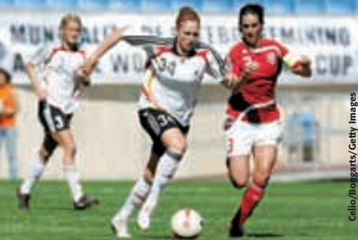
GERMANY V DENMARK AT THE ALGARVE CUP IN MARCH.