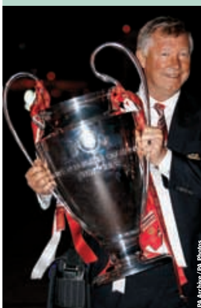
Sir Alex Ferguson with the UEFA Champions League trophy won by Manchester United in 2008.

Well, they have certainly changed in terms of the back-up required, particularly in the area of sports science. Medical information, nutrition and preparation of players for top-level games have reached another level. What has not altered, in our case, is the insistence that players train to a high standard – we have always aimed for 100% quality. I have never changed that approach because, in my opinion, what we do on the training pitch transfers to the matchday. We never allow lazy training sessions. For me, the training is an opportunity for players to express themselves as professionals. Players who don't commit themselves at training can have a negative impact on the others and things then deteriorate into a shambles – then you are not a real