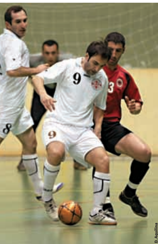
Albania and Georgia meet in a European Futsal Championship qualifier.