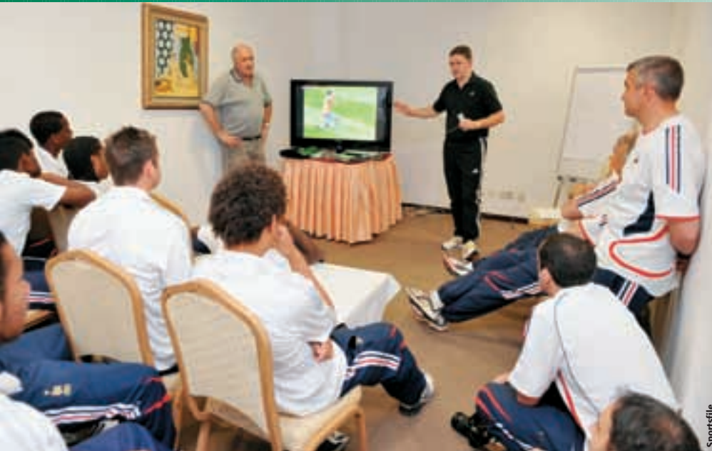
Giving explanations to the French Under-17s at the final round of their 2007/08 European championship.

to be prepared to take risks and big decisions. In other words, knowledge and talent may be important, but they are not necessarily enough. Personality counts – especially in an era where the leader's position and decisions are readily challenged.