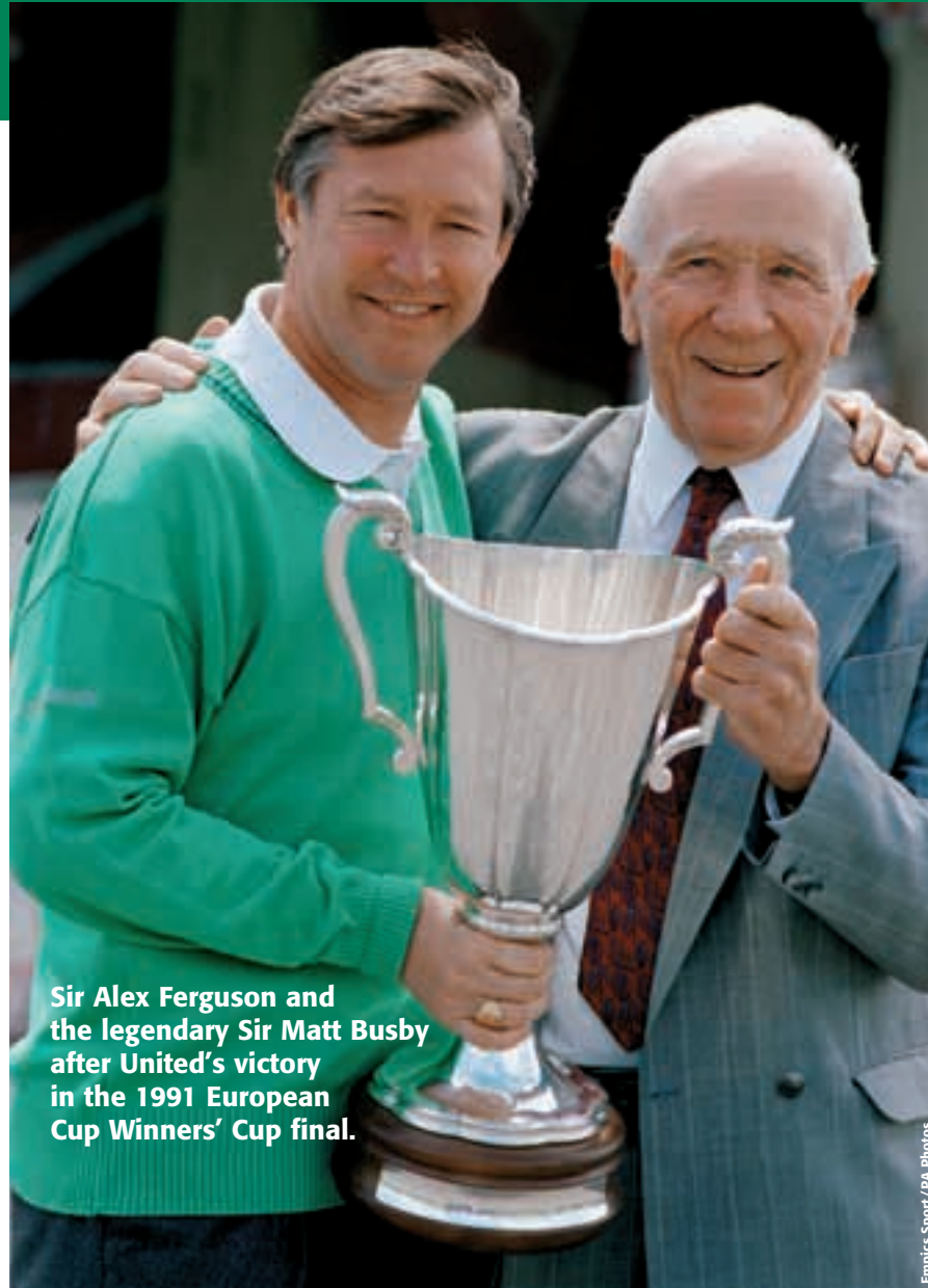
Sir Alex Ferguson and the legendary Sir Matt Busby after United's victory in the 1991 European Cup Winners' Cup final.

I have people all over the place, and this is an indication of how powerful the Premier League has become and how we have developed as a football club. For us it is a global business. This has been good for me, because I'm dealing with different cultures and I find that very interesting from a management point of view. It is simply not possible to be parochial any more.