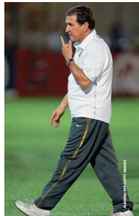
Carlos Parreira: a coach has to develop his own style.

Coach education is important. However, it is only part of the jigsaw that makes up the individual's coaching DNA. Experiences like a career as a professional player, having a father who was a coach, studying to be a teacher, surviving the sack in management, mixing with football winners, reading extensively, and so on, can all contribute to the coach with a rich history. Tough times never last – but tough people do. The top coaches who participate in UEFA's competitions are mentally strong, fully committed, well educated, and fiercely self-reliant. UEFA's coaching convention has helped the associations to upgrade, or to refine, their coach education schemes. But formal education will never be enough – coaches must also invest in themselves if they want to be special, if they want to be winners.