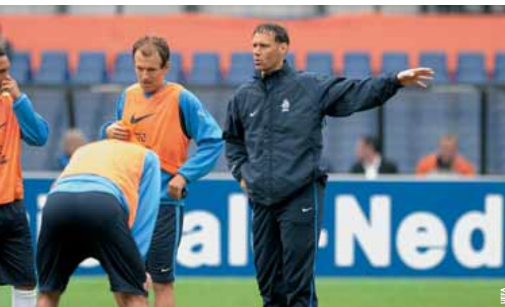
The participants follow a training session led by Marco van Basten.

It is temptingly easy to say that what works for the Dutch isn't necessarily applicable to other countries. But, with footballers crossing borders with ever-increasing frequency, club coaches will probably have to deal with players who have worked under leading technicians in other countries, while national-team coaches often work with groups of players that include, to take an imaginary example, two key players based in the German Bundesliga and three more working with top coaches in Italy or Spain. At the same time, young players are aware that their reputation and market value depend on individual and collective success at club or national-team level. As Gérard Houllier remarked, "these days kids tend to watch at least two games a week on TV and this means they listen to the commentators and the 'experts' on duty in the studio.