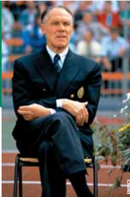
RINUS MICHELS (1928-2005)