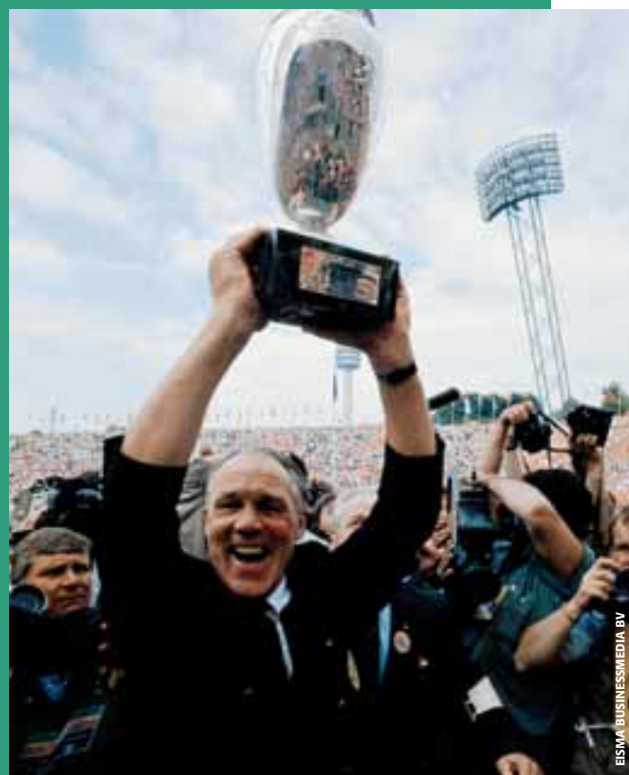
EISMA BUSINESSMEDIA BV