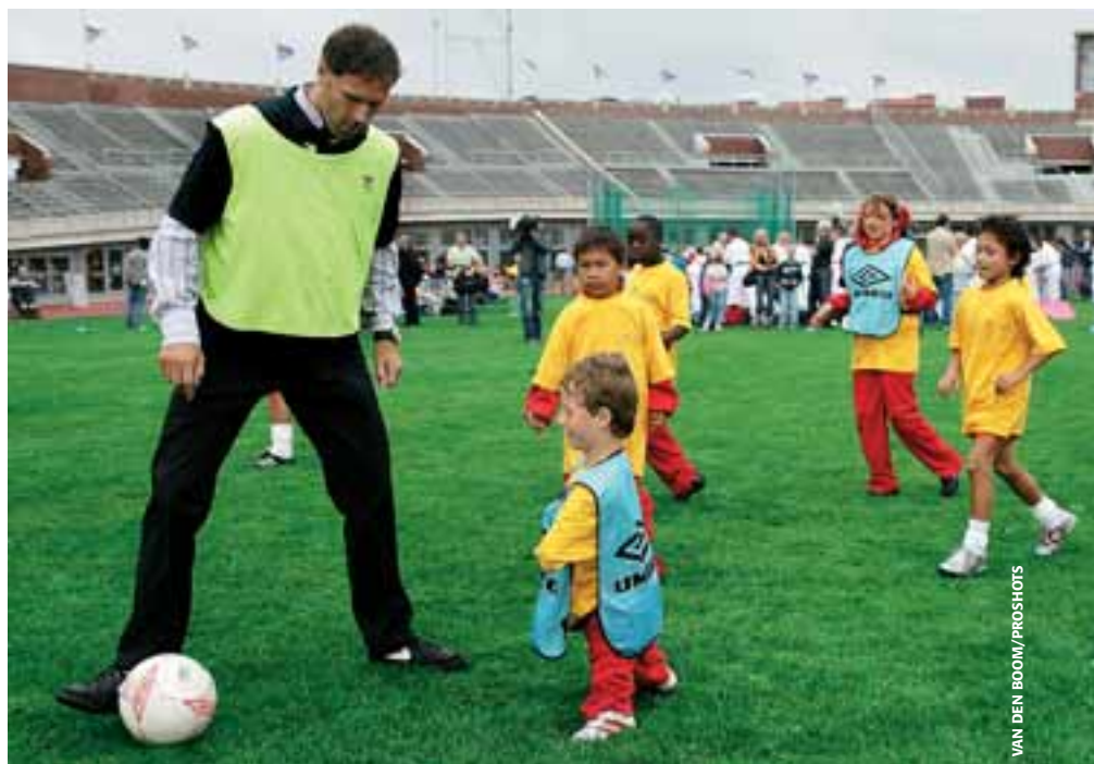
Marco van Basten encourages a young disabled player.

it was a strongly upheld view that closer liaison and coordination between football associations and the disability organisations is a desirable priority. For this to be achieved, there must be