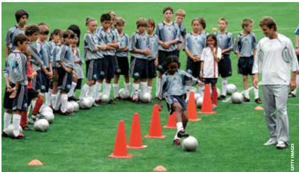
Stars like David Beckham can have an enormous influence on grassroots football.

The importance of a vibrant grassroots environment cannot be over-emphasised, neither for football nor for society in general. If there were no schools, no formal education, the world would be a poorer place. The same principle applies to grassroots football – if we don't create opportunities for people to play sport, and football in particular, then community life will suffer. At UEFA, football is our passion, our raison d'être , but we must accept our social responsibility for bringing people together and trying to make their lives better through the football experience. We cannot do much about heredity, but we can create a grassroots football environment which lets the game flourish and those who play it blossom.