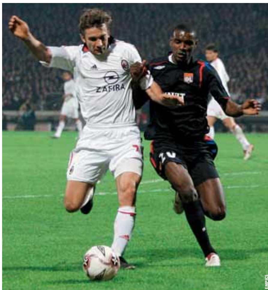
Andriy Shevchenko (in white, up against Lyon's Eric Abidal) was a street footballer.

Already six pilot associations (Norway, Denmark, the Netherlands, Germany, England and Scotland) have had their basic grassroots schemes approved by UEFA and have signed the charter agreement. The next step is to organise regional workshops during 2006 with the aim of explaining the details of the charter to the associations, in particular the philosophy, requirements and application process. These regional events will also offer an opportunity to share best practice and new ideas on grassroots football. The creation of action plans will be an important exercise during these HatTrick-funded workshops. The aim is that at least 20 associations should be