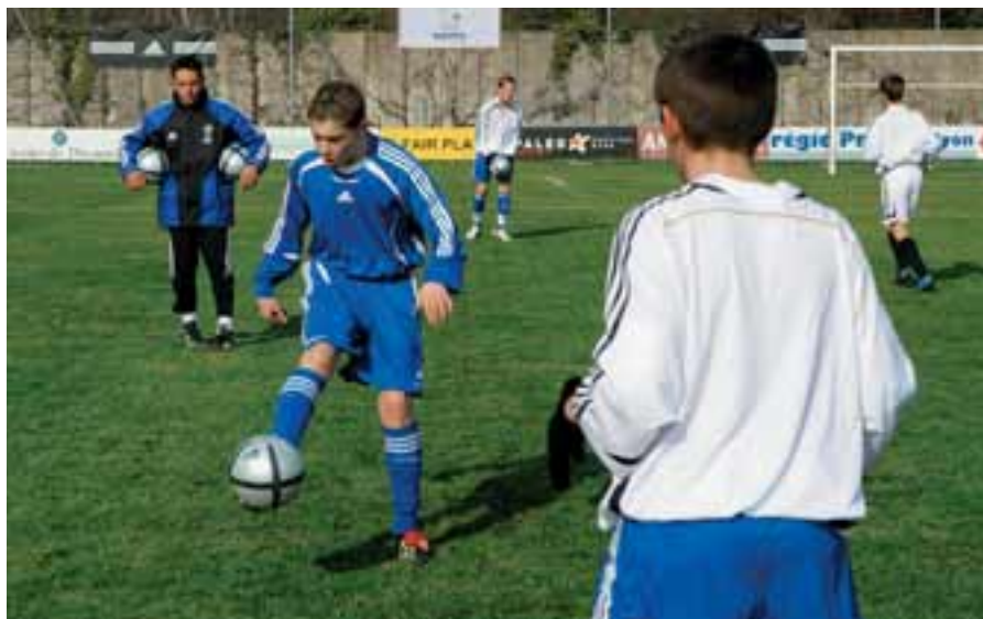
A practical demonstration at the Stade Nyonnais ground, opposite UEFA's head office.

Significantly, the event attracted 60,000 spectators. But of even greater significance was the impact on the participants themselves. No fewer than 92% claimed to have found 'a new motivation for life'. Almost half of them improved their housing situation as a direct result of the event. More than one third found regular employment and/or