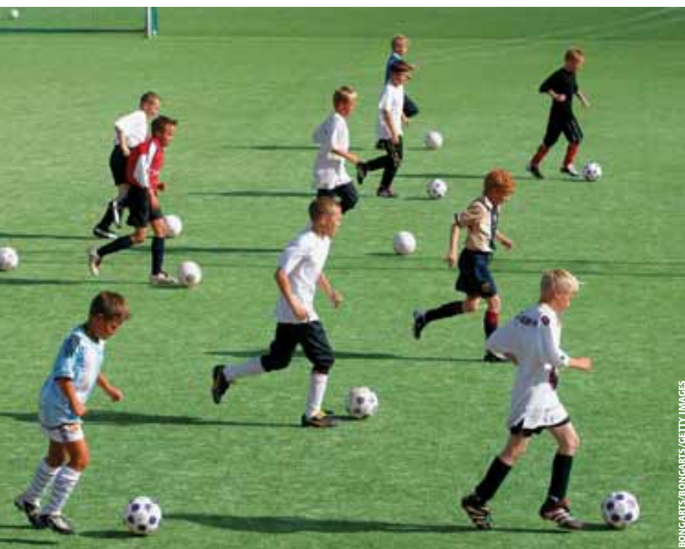
Enough footballs to go round!

Some of the other debate-provoking suggestions included funding aimed at allowing associations to appoint grassroots managers; the creation of a template for grassroots festivals; additional assistance with equipment such as footballs, T-shirts, DVDs and educational material; the inclusion of grassroots criteria within UEFA's licensing system; and maximum support from UEFA in terms of lobbying and campaigning on a pan-European basis.