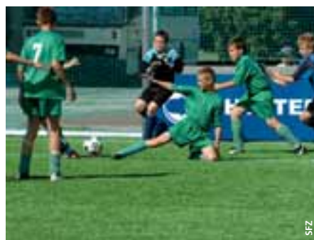
Mini champions league.