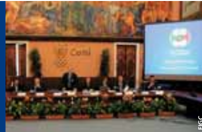
Plenary presentation during the bid seminar in Italy.