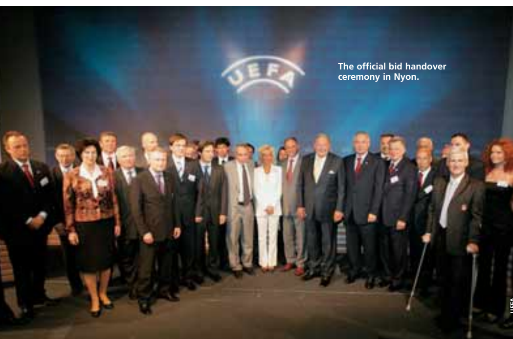
The official bid handover ceremony in Nyon.