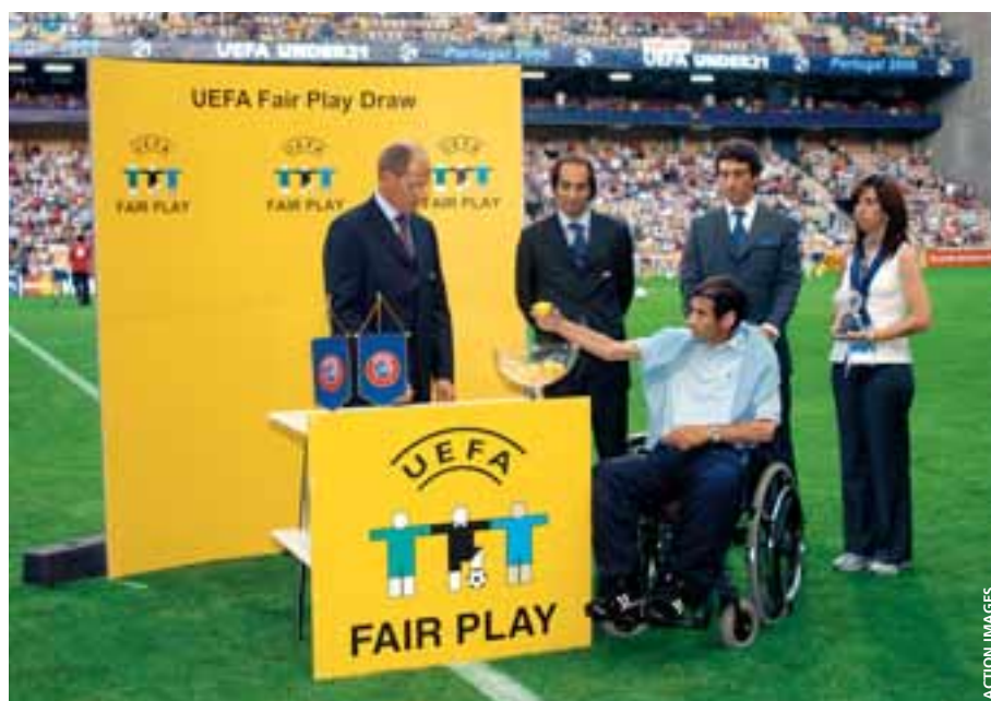
The fair play draw conducted at half-time in the European Under-21 Championship final in Porto.

From now on, the European Under-21 Championship will conclude in odd-numbered years.