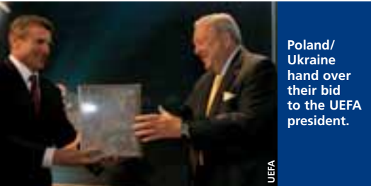
Poland/ Ukraine hand over their bid to the UEFA president.