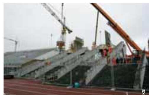
The Laugardalsvöllur stadium under reconstruction.

The Icelandic national stadium, Laugardalsvöllur, is currently being expanded and renovated. The previous seating capacity was not ideal, especially when some of the bigger teams visited Reykjavik to play the national side. Previously, the