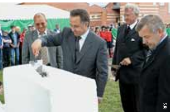
A symbolic gesture for an important centre.

The project to build a new educational and training centre for Russia's national youth and women's teams was presented in Bronnitsy (a small town near Moscow) on 23 May. The project is being implemented by the Russian Football Association (RFS) and the Bronnitsy local authorities.