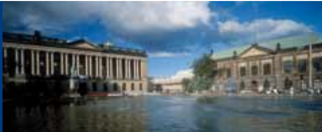
An opportunity to discover Poznan and the city's monuments.