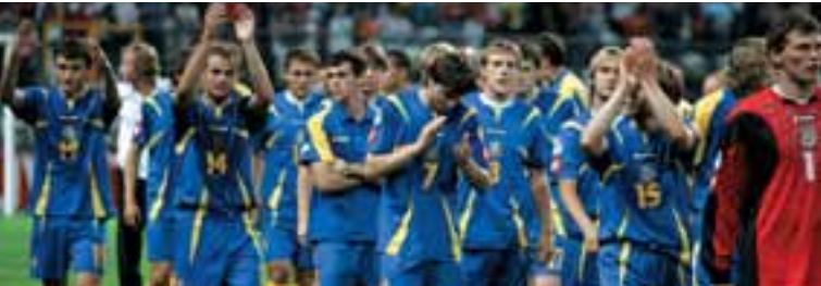
The runners-up spot for Ukraine, applauded by their fervent supporters.