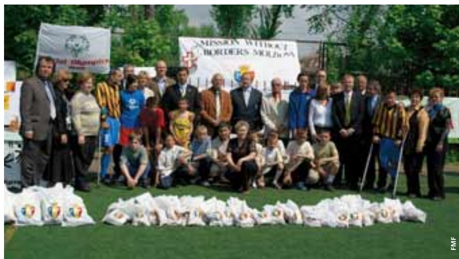
A party atmosphere reigned during Special Olympics Week.

without our help. That is why we decided to donate an artificial grass mini-pitch that will help to improve the health of these children."