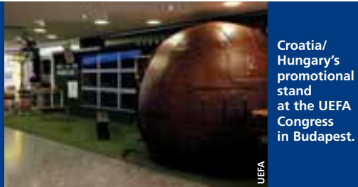
Croatia/ Hungary's promotional stand at the UEFA Congress in Budapest.