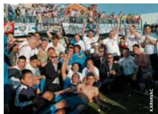
Victory for Siroki Brijeg.