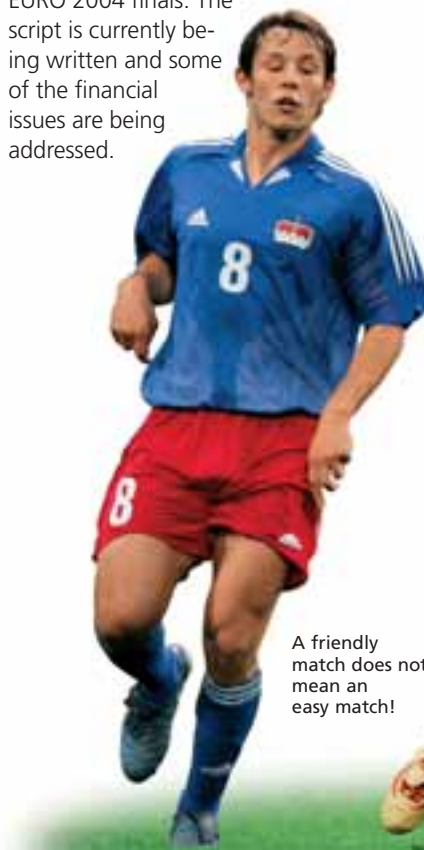
A friendly match does not mean an easy match!

seum room and probably to be used in the movie. The LFF will return items to their owners if requested. The documentary will include all the important events and developments of football in Latvia, from the very first game played in Latvia to the EURO 2004 finals. The script is currently being written and some of the financial issues are being addressed.