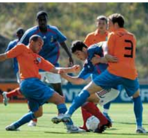
In the semi-finals, the Netherlands had a tough time eliminating France.

Since their first encounter at the start of the tournament, things had therefore changed somewhat for the Netherlands and Ukraine, to such an extent that the latter could barely draw any psychological advantage from their earlier victory. After their exploits against Italy and France, the Dutch youngsters were on too much of a high to let victory slip from their grasp. Two goals in the first half and another after the break meant the title was theirs,