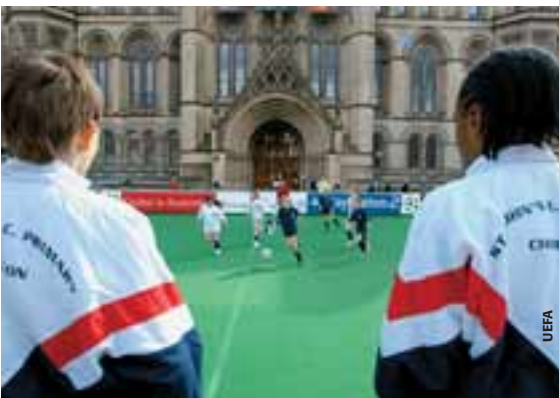
The "Starball" grassroots football tournament takes place before the UEFA Champions League final.