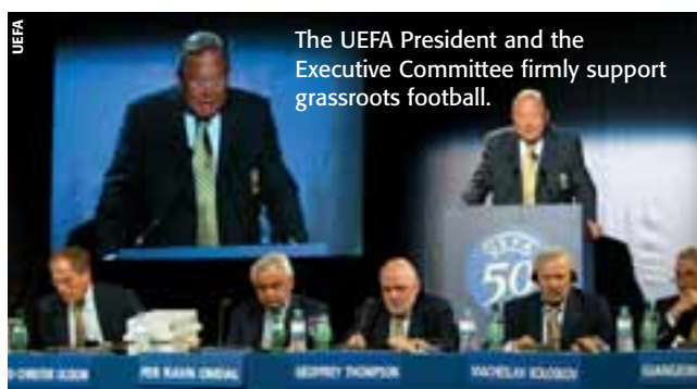
The UEFA President and the Executive Committee firmly support grassroots football.

Lennart Johansson thanked the 52 member associations in Cyprus for their support and for their work in the grassroots field.