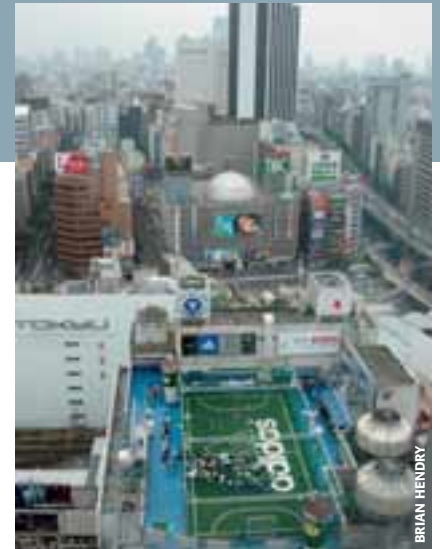
Grassroots football can be played anywhere – even on a roof in Tokyo.

UEFA TOTALLY SUPPORTS GRASSROOTS FOOTBALL.