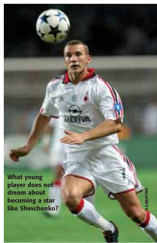
What young player does not dream about becoming a star like Shevchenko?

Producing top players and building exciting teams are key aspects of an association's strategy, but without mass participation and public interest in the game, football's popularity will wane. If the grassroots become weak, where will the next generation of players, referees, administrators, officials, coaches and supporters come from? Of course, the grassroots player dreams of becoming the next Shevchenko, Owen or Hagi. This is desirable and to be encouraged, but the production of elite players is not the main purpose of grassroots programmes. Participation and a love of the game are the core values which underpin a dynamic, all-inclusive grassroots football environment – a place where those involved "carry the ball close to their heart".