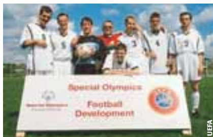
For several years, UEFA has been giving financial support to Special Olympics, an organisation which makes sport accessible to people with learning difficulties.