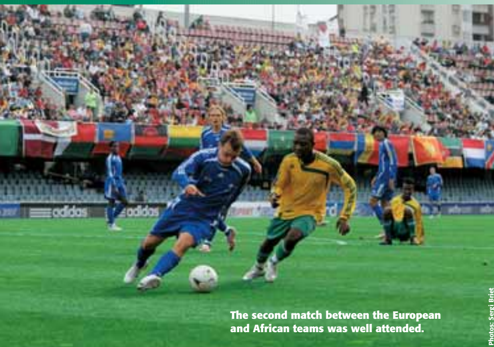
The second match between the European and African teams was well attended.