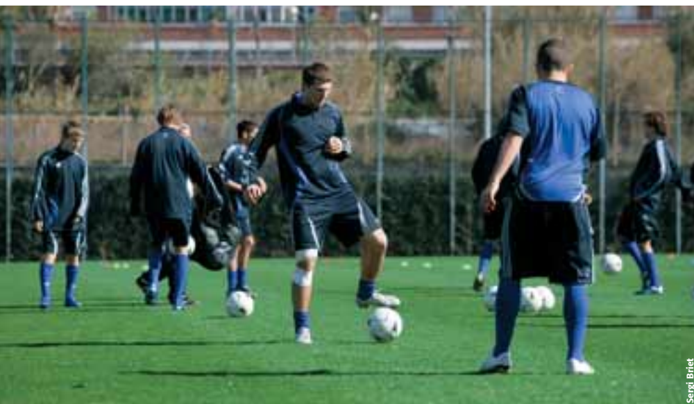
The UEFA U18 team at training.