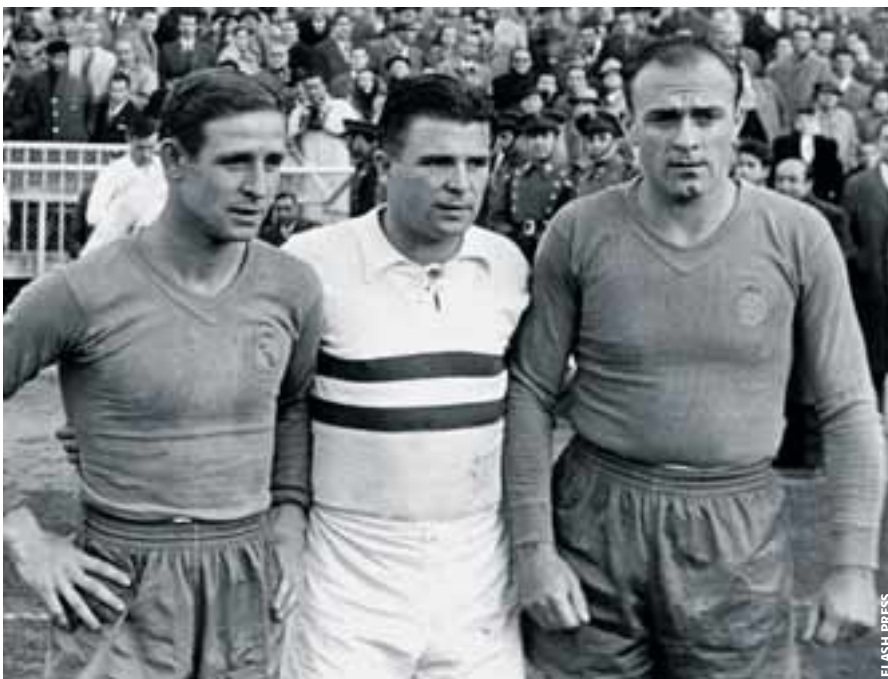
Ferenc Puskás, in his Hungarian colours, between his Real Madrid team-mates Raymond Kopa and Alfredo Di Stefano.

In the age of wall-to-wall TV coverage of football, the impact of star players like Cristiano Ronaldo or Kaká, can't be overemphasised. The elite, whether they are performers, coaches or educators, will never know the effect they have on those who look up to them, but they must be aware of the influence they have and their responsibility. Ferenc Puskás, with his humility, humour and genius, not only collected cups and medals, but, more significantly, he won the hearts and minds of countless fans and ambitious young footballers. Now with the opening of the football academy in his name, the power of Puskás lives on. In a football world of spiralling salaries and transfer fees, those with the aura and ability to inspire the next generation are priceless treasures.