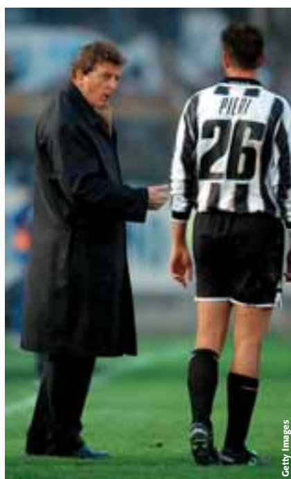
After his stint with Internazionale, Roy Hodgson had another Italian experience, with Udinese.

In the qualifying rounds and 'the final phase' the task is to produce a consistency of performance, so that the coach knows that his team are not going to let him down. You need to work very hard to avoid extremes – for example, last month your team was compact, this time you were all over the place. This is particularly significant when working with a national team where the result creates either euphoria or disaster, and has consequences for the players' morale and public expectations. As a coach of a national team you have to avoid extremes, either getting carried away because of a good result or becoming pessimistic after a loss. When you go into a final round you must be aware of what it will mean for the players to be fully concentrated for the duration of the event. Also, they are away together in a different, sometimes claustrophobic environment. The Italians can usually handle this better than most