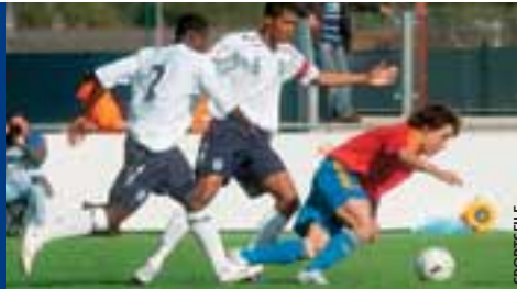
Spain and England, who met in this year's European Under-17 Championship final, are taking part in the FIFA U-17 World Cup in Korea.