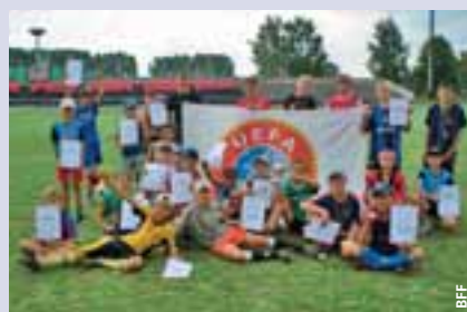
Prizes all round during the Summer of Grassroots Football.

This is the fourth year that football matches are being held with the participation of schoolchildren, orphans, residents of children's homes, disabled