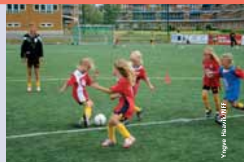
The football schools are attracting more and more participants.