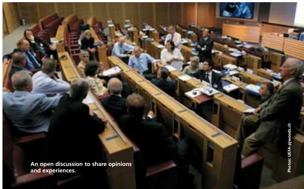
An open discussion to share opinions and experiences.

The fourth DCO seminar will be held in spring 2008.