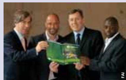
The intercultural programme is launched at Dublin City Hall.

■ As the FAI Senior Challenge Cup kicked off recently, the FAI welcomed Ford on board as new sponsors of the competition. This is the first year that Ford is sponsoring the FAI Cup, although the