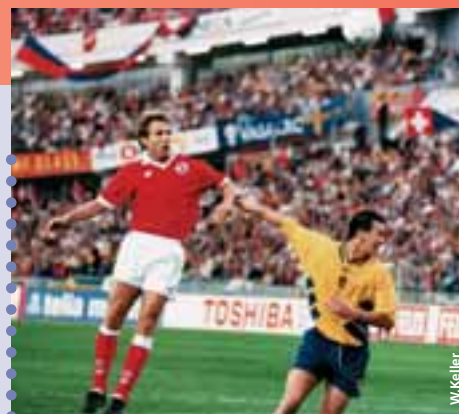
Adrian Knup playing against Sweden in 1995 in Gothenburg.