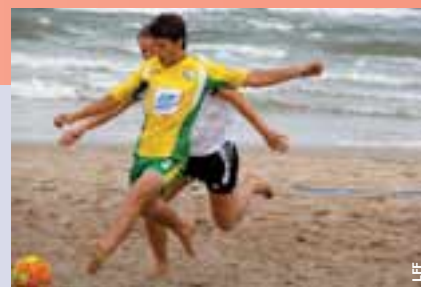
Beach soccer is growing steadily in popularity.

The first round of the championship involved 22 teams from all over the country.