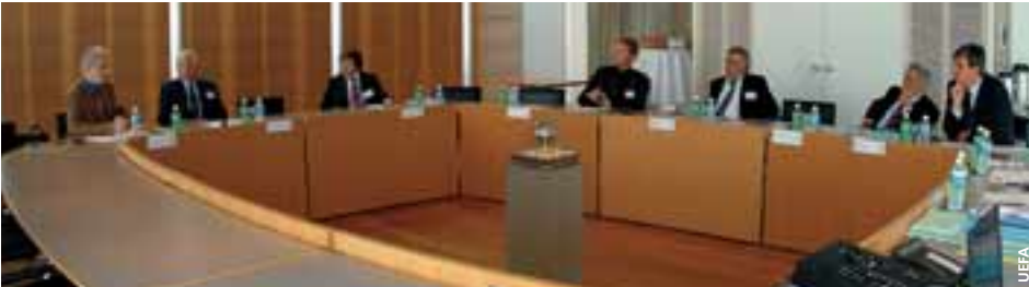
A meeting of the Agents Panel at the end of 2004.