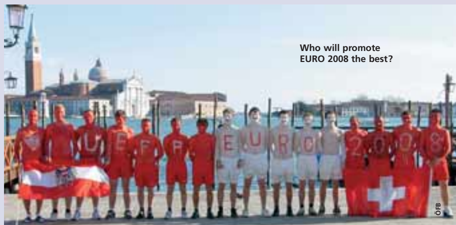
Who will promote EURO 2008 the best?

The semi-finals therefore awaited us and brought our team up against the Group B winners, Serbia. Belgium put up a brave fight and even dominated the play. Unfor- →