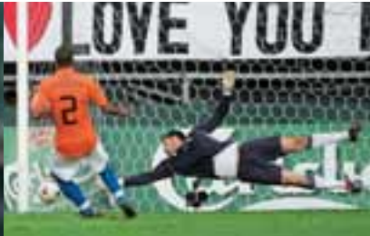
An interminable penalty competition to separate the Netherlands and England in the semi-finals.

Serbia (Nikola Drincic, 13) beat Belgium (Faris Haroun) in the second semi-final.