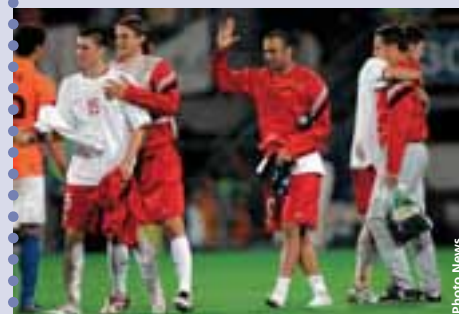
Belgium's under-21s performed brilliantly, despite not reaching the final.