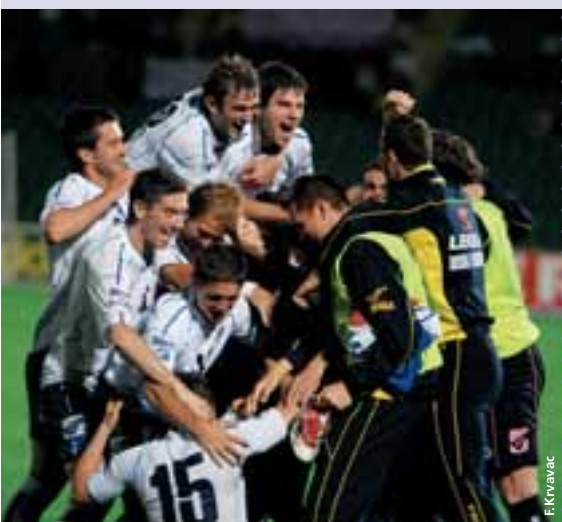
Renewed ambitions for the national team after three wins in a row in the EURO 2008 qualifiers.

After a debacle at the start of the qualifying competition, the totally reshaped team already surprised Norway in March in Oslo by defeating them 2-1. That success was followed by wins at home in Sarajevo against Turkey (3-2) and Malta (1-0). In their remaining qualifying matches, the national team will play host to Moldova and Norway, and travel to Hungary, Greece and Turkey.