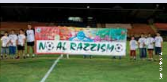
A shower of droplets to say no to racism.

The project was carried out during May and June. It included a series of actions such as advertising in the mass media, advertising banners at stadiums and the main training grounds, T-shirts and gadgets.