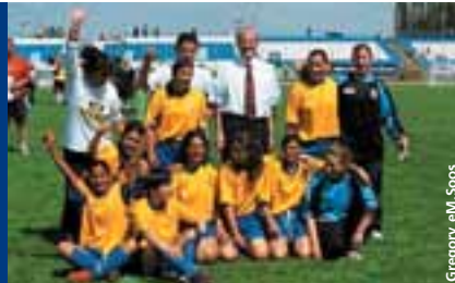
Hungarian president Laszlo Solyom met the Hungarian Special Olympics players.