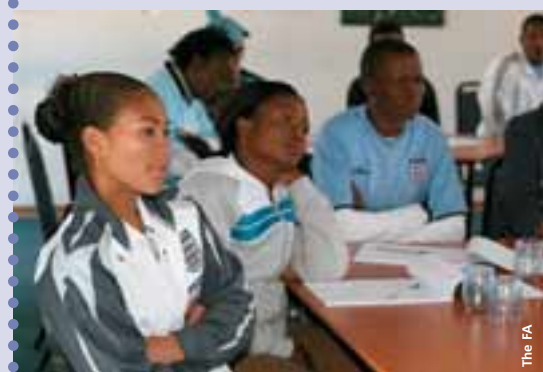
Rachel Yankey finds out about women's football in Africa.