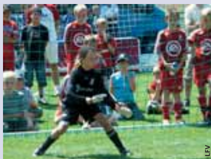
Concentrating on winning a medal.