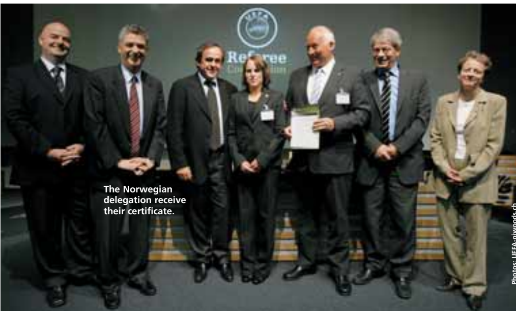
The Norwegian delegation receive their certificate.

Two modules were defined within the convention. The first is training-based and includes four key aspects: the recruitment and retention of referees, the referee observer system, the talent and mentor programme and referee education at grassroots and elite levels. The second module describes the organisation and structure of refereeing as well as the aims and main tasks of such a structure.