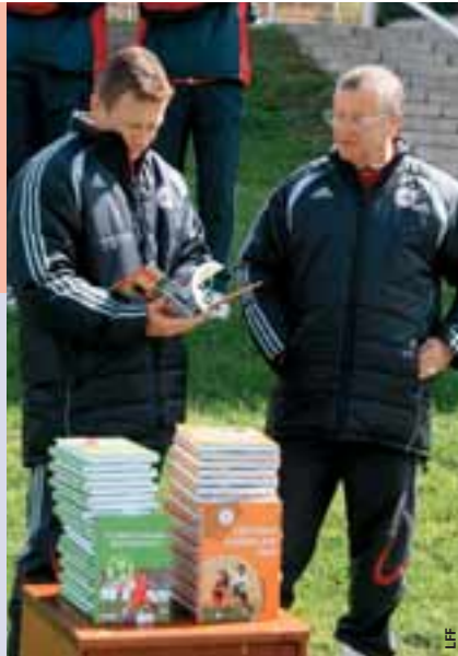
Extending training throughout the country with regional courses and material.

→ beginning of June were against Spain and Denmark. Next up is home friendly in mid-August against Moldova.