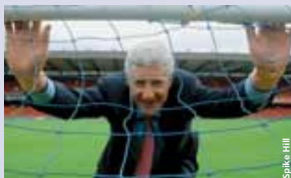
Nigel Worthington, the new national coach, is eagerly awaiting Northern Ireland's next matches.