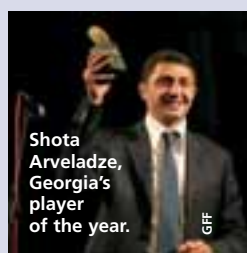
Shota Arveladze, Georgia's player of the year.