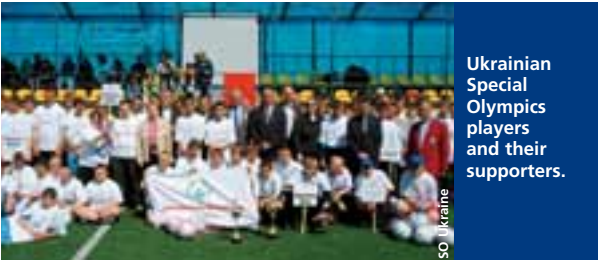
Ukrainian Special Olympics players and their supporters.