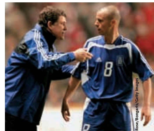
Otto Rehhagel, winner of EURO 2004 and one of the five coaches to have taken part in the last two European Championship final rounds.

Not having the aid of a crystal ball, it is difficult to predict who will lift Europe's ultimate prize in international football on 29 June 2008. Goalscoring efficiency will certainly play a factor, and the exploits during the qualifying campaign of Croatia's Eduardo (10 goals in 12 strikes), Poland's Smolarek (9 goals in 15 strikes), Germany's Podolski (8 goals in 14 strikes) and Portugal's Ronaldo (8 goals in 31 strikes) augur well for their sides' prospects. But, without question, the managerial acumen and the tactical prowess of the 16 coaches, not forgetting the quality and condition of their players, will have a significant impact on the outcome of an event which will attract a massive global audience. No doubt, luck will play a part, and as events unfold, some will search the shadows of superstition for intangible support. But for most of us, reading the game will be far more important than reading something into a number – even if it is a 13.