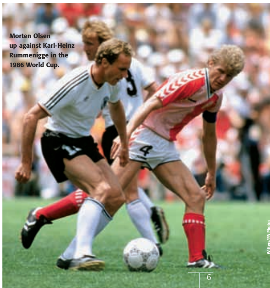
Morten Olsen up against Karl-Heinz Rummenigge in the 1986 World Cup.

The game has undoubtedly got quicker and more compact, and this means you need better technique and an ability to