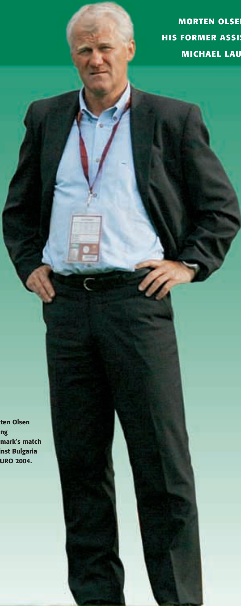
Morten Olsen during Denmark's match against Bulgaria at EURO 2004.