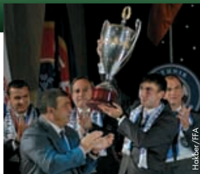
FC Pyunik Ararat lift the championship trophy