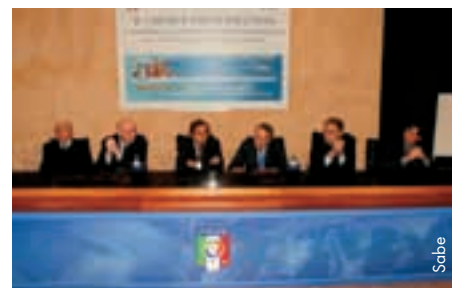
Discussing current affairs in European football

The UEFA President, Michel Platini, and the general secretary, Gianni Infantino, attended the fourth Italian sports journalists' union (USSI) seminar, entitled Football and those who talk about it and held in Coverciano on 24 and 25 January.