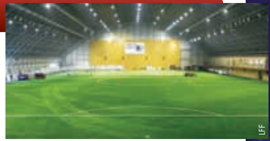
Skonto football hall

In other news, the Latvian Virsliga has lost its title sponsor, LMT, but will nonetheless start in mid-April with nine teams competing in four rounds (SK Blazma Rezekne have dropped out for financial reasons). The Latvian Football Federation (LFF) often holds meetings with Virsliga clubs in order to involve them in the organisation and marketing of the league, in an effort to