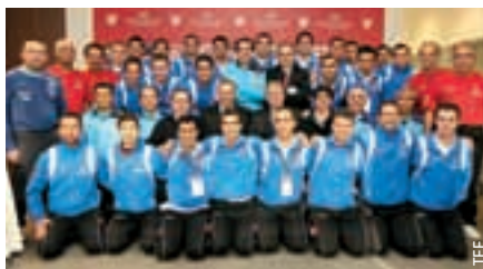
Advanced training for referees