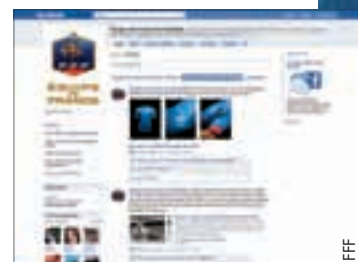
The national team's official Facebook page

Aside from discussions and debates among users, the page will regularly include games and applications to enliven the virtual community, as well as tickets to the team's matches up for grabs in competitions run by the FFF. If you want to be in with a chance, it couldn't be easier: simply go online and join the new Facebook community! ● Matthieu Brelle-Andrade