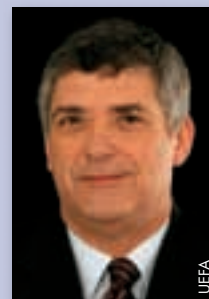
Ángel María Villar Llona (Spain)

I believe continuity is important in football and I hope that I can further pursue my objectives in working for the interests of the whole European football family. ●