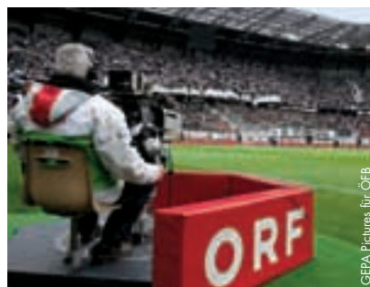
Impressive audience figures for Austrian TV