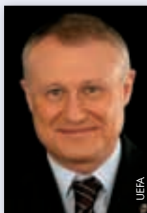
Grigoriy Surkis (Ukraine)

Born on 4 September 1949, Grigoriy Surkis has been president of the Football Federation of Ukraine since 2000. He is also vice-chairman of the Ukrainian Olympic Committee. Having been a co-opted member of the UEFA Executive Committee from 2004 to 2007, he was elected as a full member in 2007. He is currently chairman of the Youth and Amateur Football Committee.