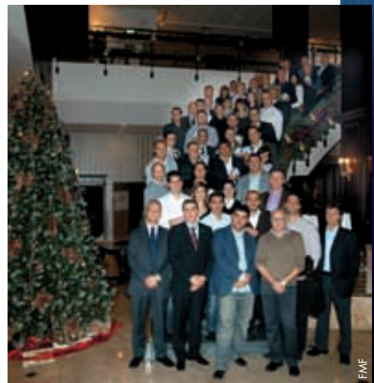
The KISS workshop participants