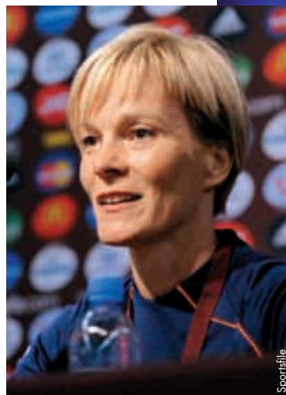
Vera Pauw, Russia's new technical director for women's football