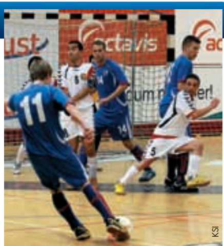
Iceland v Armenia