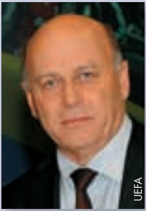
Grzegorz Lato (Poland)

Born on 8 April 1950, Grzegorz Lato, a former Polish international, has been president of the Polish Football Association since October 2008 and is vice-chairman of the UEFA Football Committee.