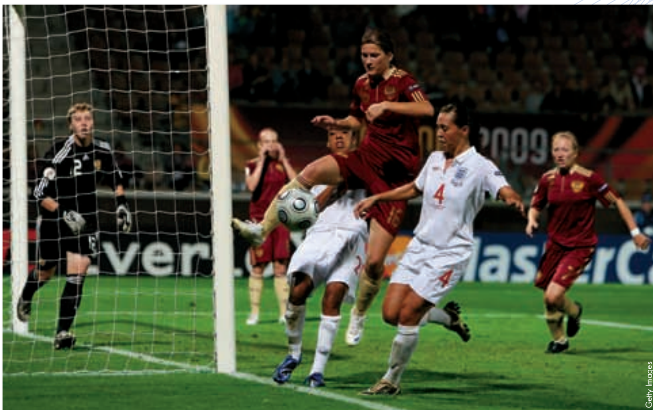
Russia v England in a Women's EURO 2009 group match

The Russian federation has faced problems linked to the size of its territory: the top division, which contains the best seven teams in the country, is organised on a national basis, but in reality these clubs are concentrated in western Russia, particularly the Moscow area. Perm, on the edge of the western Urals, is the furthest away. The seven elite professional clubs play each other four times, twice at home and twice away. Division one, the second national category, includes 32 clubs, spread all over the country, which would mean teams would have