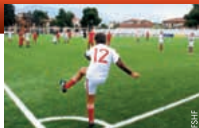
The number of youth teams is set to double between now and 2014

Furthermore, the FSHF is preparing to launch an intensive, long-term programme in collaboration with primary and secondary schools all over the country. Negotiations with the government to include football in the primary school curriculum have progressed and if successful will be a massive step forward for Albanian football. As a first, immediate measure, several local and regional football tournaments for secondary school teams are starting up this year. Another ini-