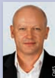
Ivan Hašek (Czech Republic)

is the qualitative and quantitative growth of UEFA and its member associations, without upsetting the financial balance, of course. From a sporting point of view, I want to dedicate myself to the promotion of national team and club football equally. The club and national team tournaments and championships staged by UEFA constitute the financial basis of the organisation and, by extension, many of its member associations too. It is therefore critical that these spectacular competitions are promoted and protected in equal measure. The national associations should use the funds they receive to promote both grassroots and professional football in their countries and, when doing so, remain particularly mindful of the long-term financial stability of their association and its clubs. Professional and grassroots football should develop alongside each other. The political, economic and social importance of football also needs to be better recognised in society. I know what needs to be done to consolidate and even improve the position of European football, and, being Swiss, I am used to working with people from different cultures and in different languages. Just like on the pitch, the focus must be on respect and fair play." ●