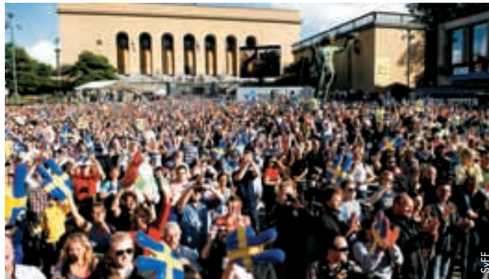
The women's national team get a warm welcome home in Gothenburg after winning bronze at the Women's World Cup in Germany

The Swedish women's national team claimed bronze medal at the FIFA Women's World Cup in Germany and, in the process, a place at the 2012 Olympic Games. Their semi-final was watched live by 1.8 million TV viewers, one of