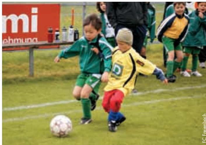
With 16 teams, FC Freienbach are very active at youth level

For many years, the Swiss national team have also trained at FC Freienbach's Chrummen ground when preparing for internationals and staying at the nearby Panorama Resort & Spa in Feusisberg.