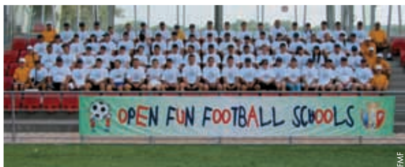
Leaders of the Open Fun Football Schools