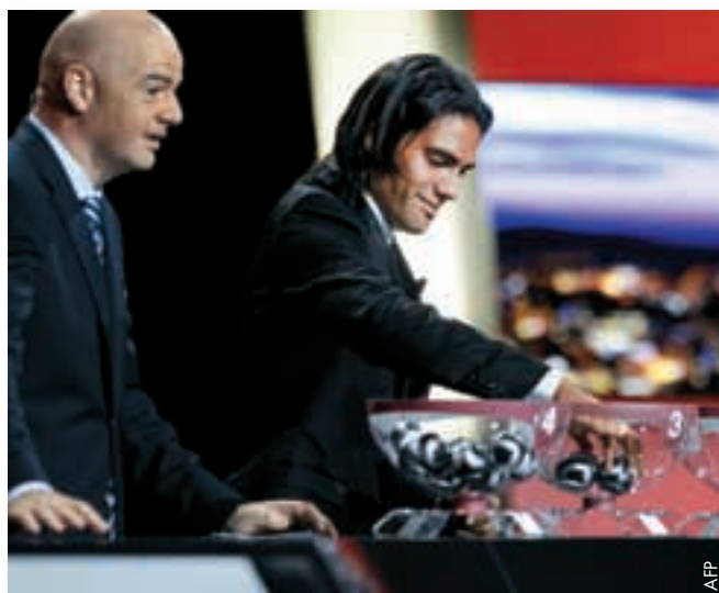
Top goalscorer in last season's Europa League, Falcao helped the UEFA general secretary, Gianni Infantino, to conduct the draw

The list of teams entering this season's Europa League group stage is once again packed with big names in European club football, featuring as it does 12 previous UEFA club competition winners in the form of Club Atlético de Madrid, RSC Anderlecht, Celtic FC, Dynamo Kyiv, S.S. Lazio, Paris Saint-Germain FC, PSV Eindhoven, FC Schalke 04, ŠK Slovan Bratislava, Sporting Clube de Portugal, FC Steaua Bucuresti and