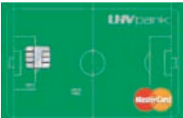
The new supporter's bank card

tional youth team matches, discounts from EJL partners, and other benefits. The card has no issuing, renewal, closing or safekeeping costs while all internet banking services are also free of any service charge.