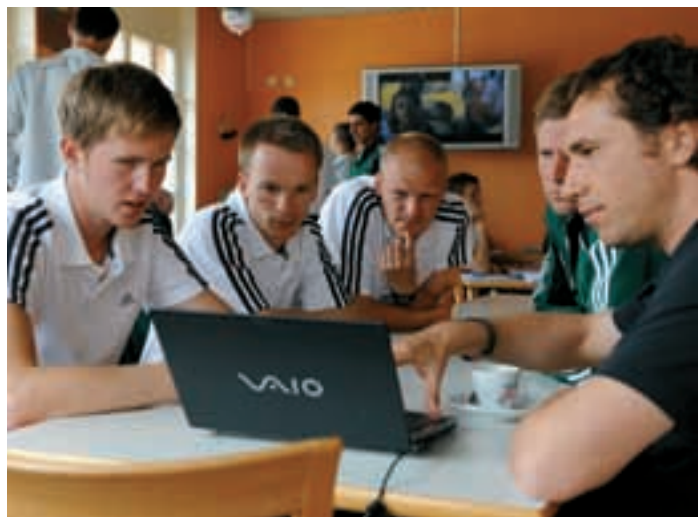
Video analysis to improve performances

"The lectures and presentations were of a high level, interesting and to the point. They concluded with a clear message but also contained a healthy level of humour. They covered every aspect of the game and presented the UEFA guidelines for refereeing international matches. We also had superb physical training sessions. We had the opportunity to practise on the field what we had