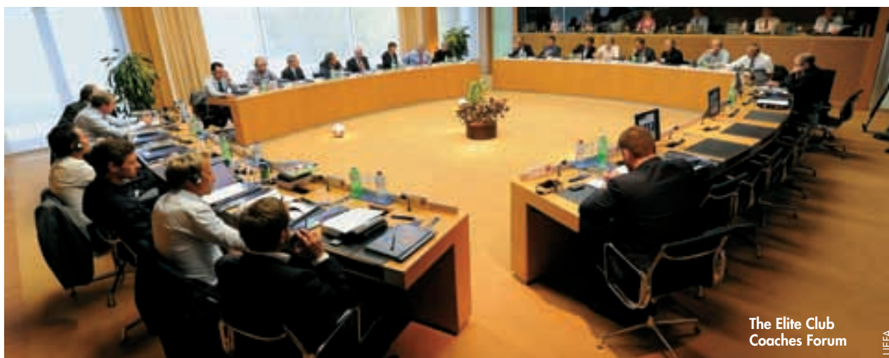
The Elite Club Coaches Forum

These are just a couple of samples of the many thought-provoking issues to emerge from an intensive, high-profile event which allows the coaches to serve a wide range of discussion points directly onto UEFA's table. ●