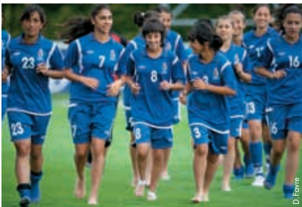
Azerbaijan's women's U17s enjoyed their time in Switzerland