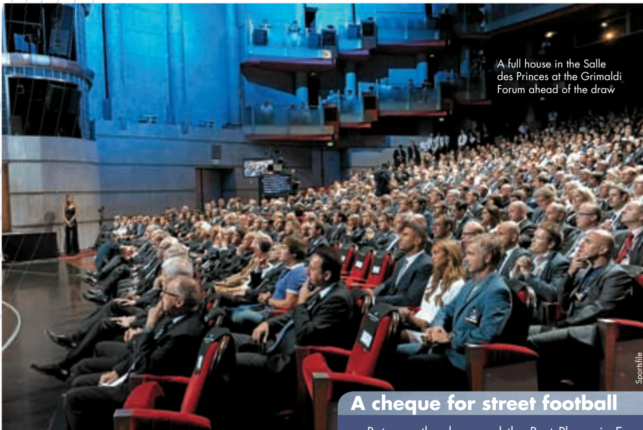
A full house in the Salle des Princes at the Grimaldi Forum ahead of the draw