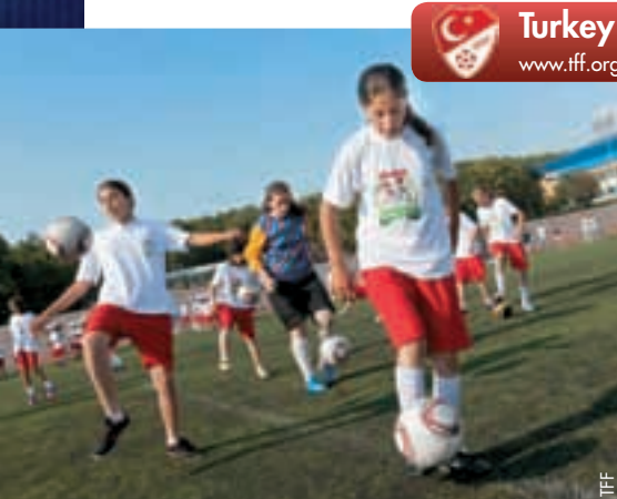
A lot of girls benefit from the football camps