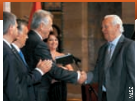
Flórián Albert honoured by the Hungarian president