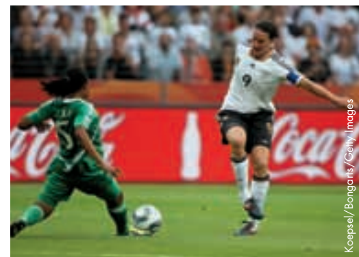
Birgit Prinz in action against Nigeria during the 2011 Women's World Cup

In the course of her long career, the Frankfurt-born player has won more than 30 international and domestic titles. Her 214 national team appearances resulted, among others, in two World Cup and five European Championship titles, not to mention three Women's World Player of the Year awards.