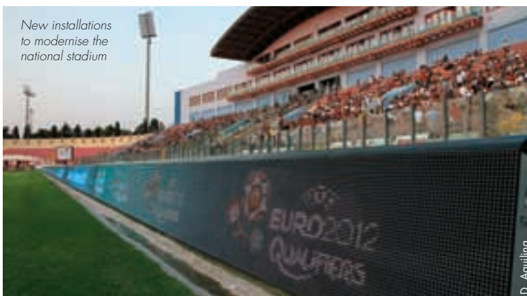
New installations to modernise the national stadium

At the main Ta' Qali stadium, better entry and security systems have been installed, including a new electronic ticketing system; easier access to all sectors, with new turnstiles at each entry point; new media boxes and ancillary improve-