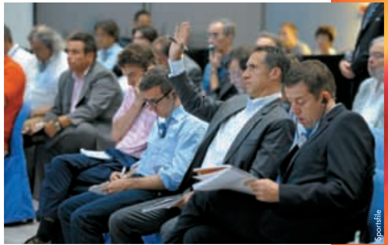
Journalists got to meet the UEFA president, Michel Platini, and UEFA's chief refereeing officer, Pierluigi Collina

With so many media representatives travelling to Monaco, it has become customary for the UEFA president to meet them for a rundown of the hottest topics in European football.