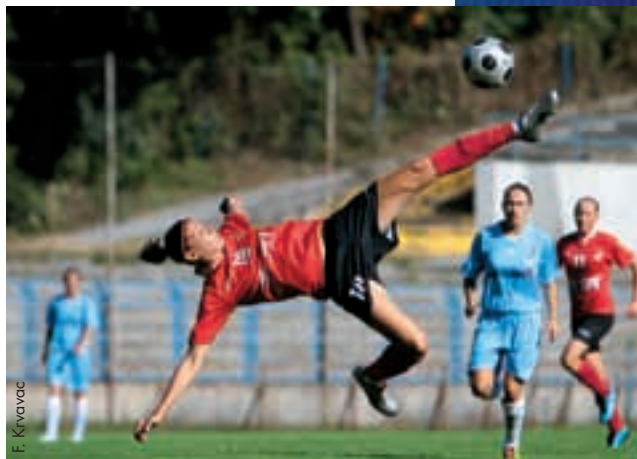
SFK 2000 Sarajevo regain possession in spectacular fashion