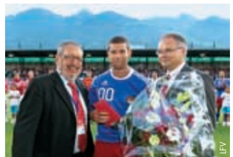
Mario Frick ahead of his 100th international