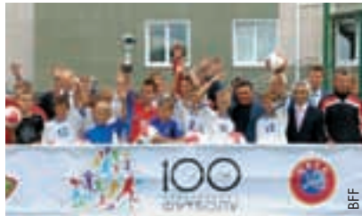
The winners of the rural schools tournament

The leaders of the Football Federation of Belarus (BFF) and of the regional federation took part in the celebrations together with local dignitaries.