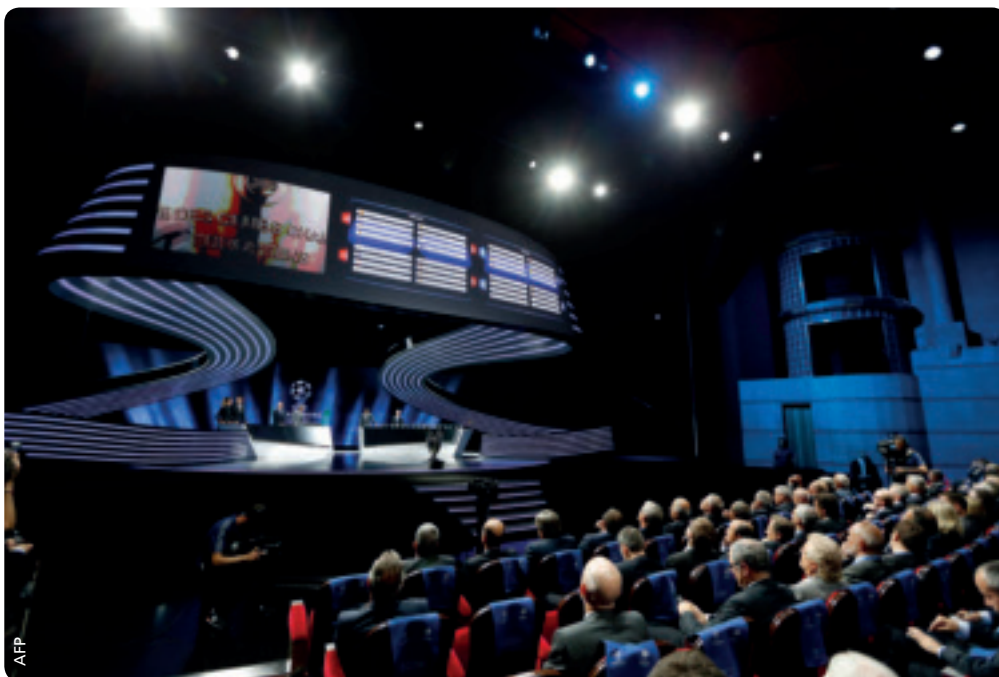
The Salle des Princes at the Grimaldi Forum, the traditional venue for the group stage draw

22 clubs that had entered the group stage directly and the 10 that had made it through qualifying (via either the champions or the league route). The first group matches are on 17 and 18 September.