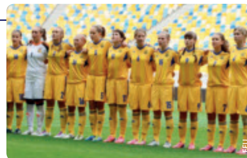
The Ukrainian women's Under-17 team