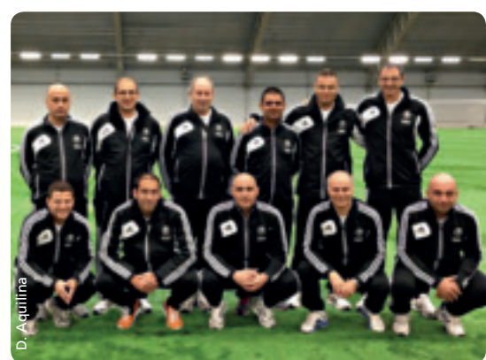
The 11 coach educators from the Malta FA who travelled to Sweden to participate in a UEFA study group