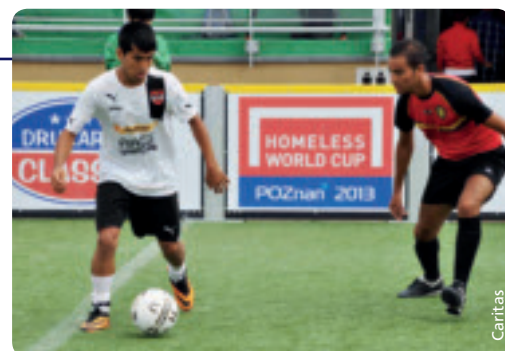
Austria play Belgium in Poznan