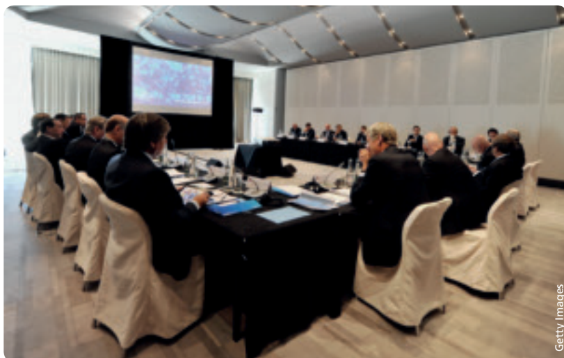
The UEFA Club Competitions Committee in Monaco

The working group tasked with organising the competition will monitor developments carefully in order to learn lessons for the future. ●