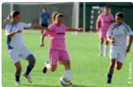
SFK 2000 Sarajevo (in pink) are favourites to win the national championship

In mid-August, the first ever nationwide women's league was launched in Bosnia and Herzegovina. Eight teams are participating: five from the Football Association of the Federation of Bosnia and Herzegovina (FF F BiH) – SFK 2000 Sarajevo, ŽNK Zenica Čelik, ŽNK Gradina Srebrenik, ŽNK Salt City Tuzla and ŽNK Mladost Nević Polje – and three from the Football Association of Republika Srpska Bosnia and Herzegovina (FF RS BiH) – Banja Luka, Radnik Bumurung (from Bijeljina) and Mladost Novi Grad (from Bosanski Novi).