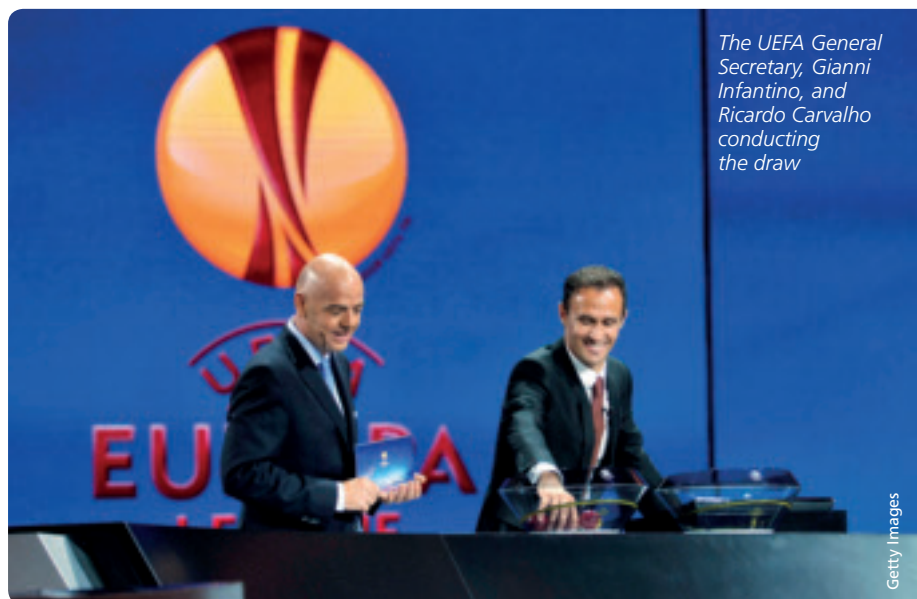
The UEFA General Secretary, Gianni Infantino, and Ricardo Carvalho conducting the draw