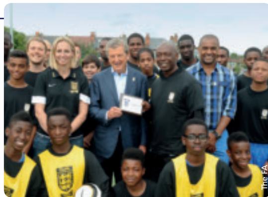
Faye White and Roy Hodgson in Lewisham to mark the first Sir Bobby Robson National Football Day

To find out more about the Sir Bobby Robson National Football Day and the local events, and