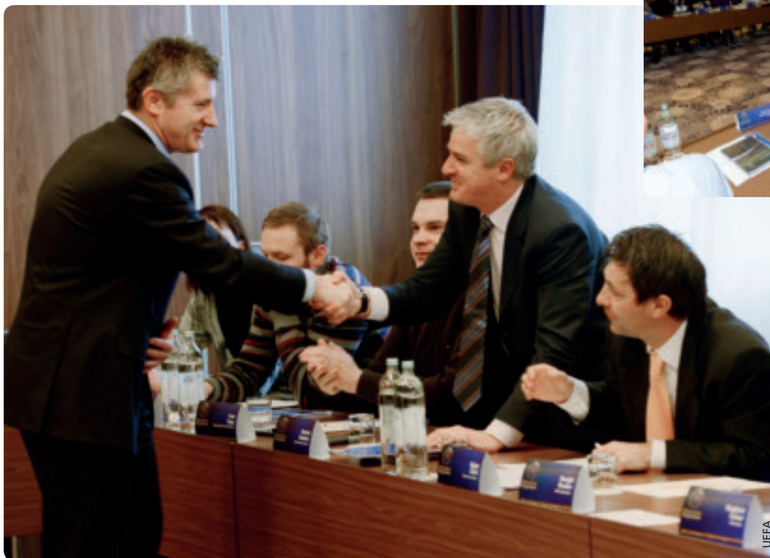
Davor Šuker, president of the Croatian Football Federation, welcomes participants to the pilot course in Zagreb

On an annual basis, UEFA can now provide five CFM national edition courses for up to 175 potential graduates. The host associations for next year are nearly finalised and UEFA will work closely