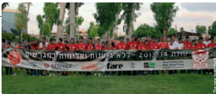
A call for respect and tolerance

To promote this worthy cause, both teams at the opening day match between Hapoel Tel-Aviv FC and Bnei Sakhnin FC wore T-shirts bearing the slogan Football For All in Hebrew, Arabic and English during the warm-up and before kick-off. Players also kicked adidas balls bearing the Respect logo to fans in the stands.