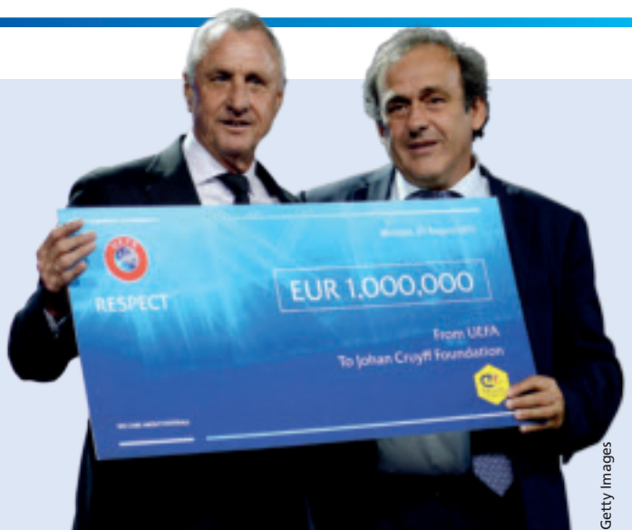
A cheque for €1 million for the Johan Cruyff Foundation, presented by the UEFA President, Michel Platini

UEFA's donation, which was presented during the gala evening at the Monte Carlo Sporting Club, will be