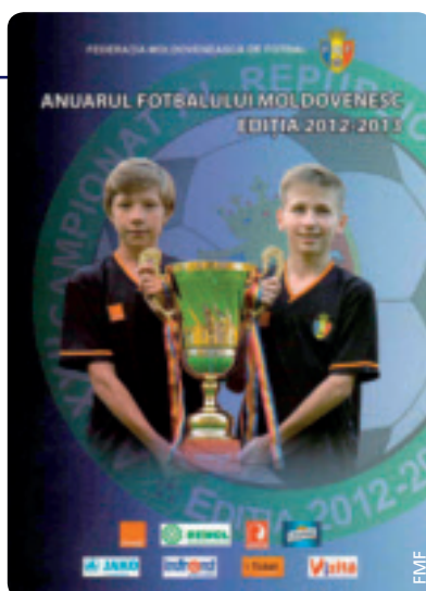
A fount of useful information

The book contains copious statistical information on the 2012/13 season in Moldovan football, including all appearances and goalscorers for the Moldovan National Division, Division A and Division B, as well as lots of photos and selected historical records for each club. The yearbook is a must for statisticians, providing full individual analysis for each National Division club. Facts, photos and figures are complemented by a narrative review of the season for each club in the top division. The yearbook also contains, among other things, a