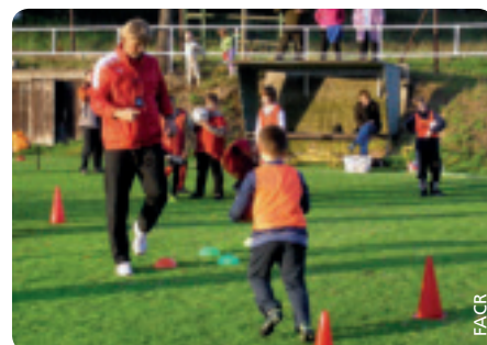
A programme to better adapt training to youngsters' needs

The Football Association of the Czech Republic has launched a revolutionary programme – the Flying Coaches project – which seeks to develop youth football and coach education at grassroots level.