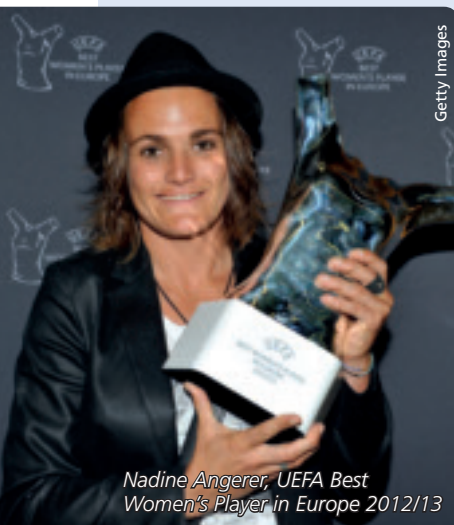
Nadine Angerer, UEFA Best Women's Player in Europe 2012/13

the European Sports Media Group (ESM) then shortlisted three in a first round of voting and, from those three, elected Angerer as overall winner. ●