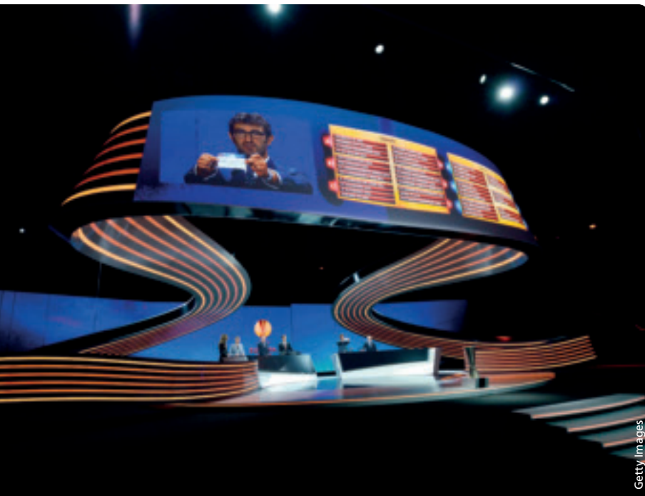
The Europa League group stage draw

Unless they enter through the UEFA Champions League, neither of last season's UEFA Europa League finalists, Chelsea FC or SL Benfica, will be lighting up this season's competition.