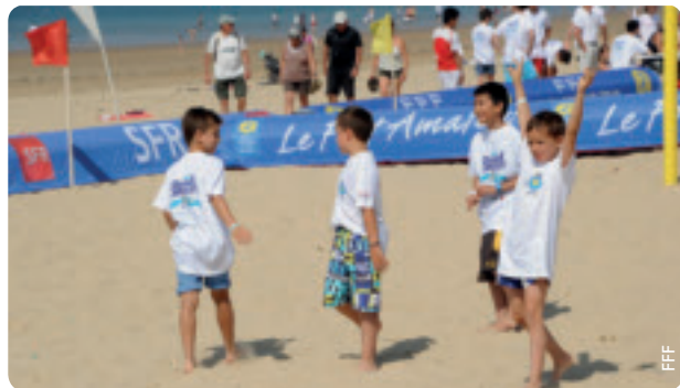
Beach soccer is proving a great success in France

Between 6 July and 22 August, the Beach Soccer Tour went on its annual journey around the country. It travelled from the North Sea to