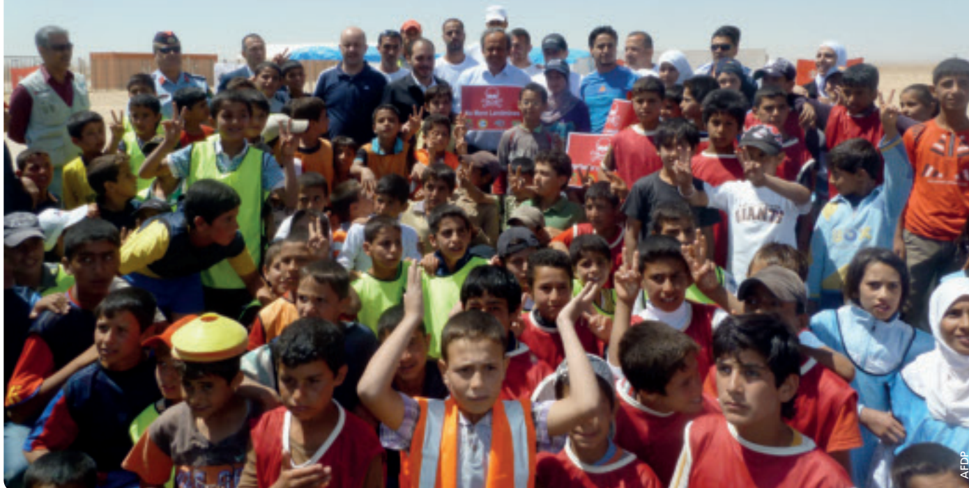
The UEFA President, Michel Platini, and Prince Ali Bin Al Hussein at the refugee camp

Since March 2011, a brutal civil war has been raging in Syria. Over 93,000 Syrians are already dead, 6,500 of whom are estimated to be children. Every day, thousands are fleeing to neighbouring countries to escape the violence and deteriorating socio-economic conditions.