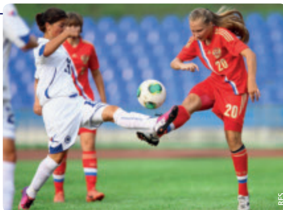
A closely fought match between Bosnia and Herzegovina (left) and Russia