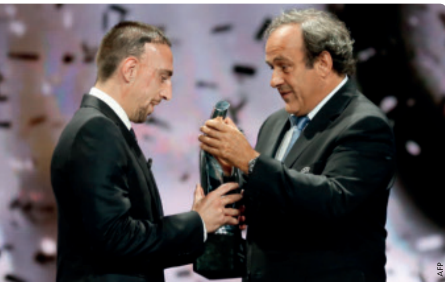
The UEFA President, Michel Platini, presents Franck Ribéry with the UEFA Best Player in Europe Award

The draw was conducted on the same basis as usual, allocating places in the eight groups to the