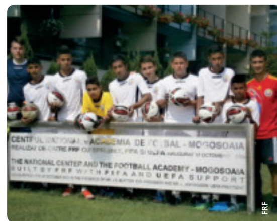
The national training centre in Mogoșoaia was the venue for the four-day youth training camp

The camp was organised as a result of the partnership between the Romanian FA and Coca-Cola Romania. The winners of the 2013 edition of the Coca-Cola cup for high schools (the boys' team of the Auto Technical High School in Craiova and the girls' team of the Grigore Moisiu High School in Urziceni), both aged 16 to 18, were awarded a four-day training camp at the centre, which hosts all Romania's national teams including the seniors. Those teams were accompanied by 12 children aged 10 to 14 from an orphanage in Bucharest's District 5, which has a special partnership with the Romanian FA and is included in its social responsibility programme.