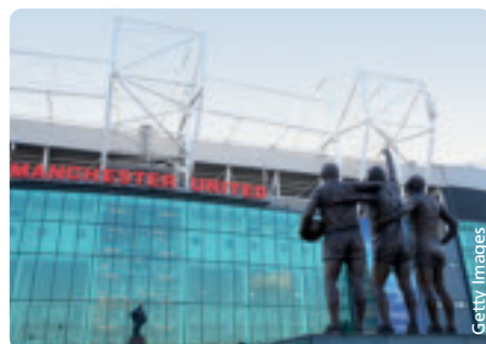
The young Croatians were victorious at Old Trafford