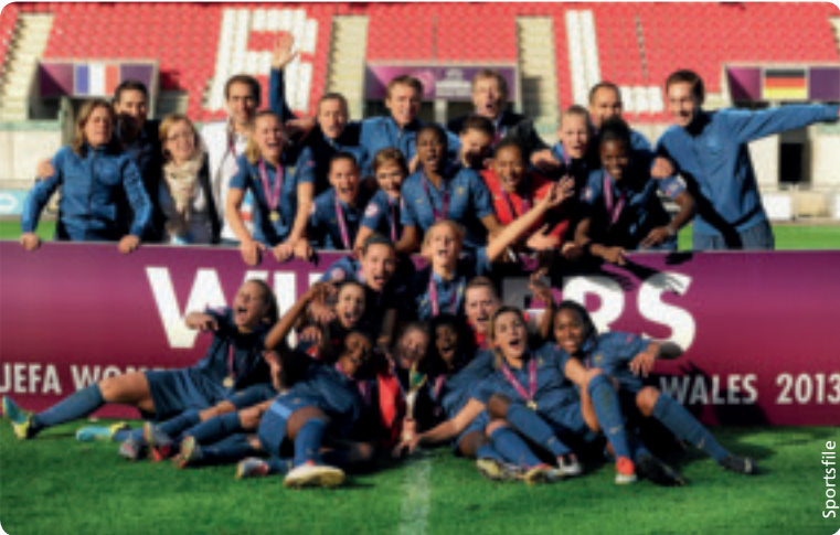
A European women's Under-19 title for France to go with last year's U-17 Women's World Cup

France laid promising foundations for the future of the senior teams by reaching both of UEFA's Under-19 finals in 2013. But whereas the boys went home from Lithuania with silver medals, the girls went one better by striking gold in Wales.