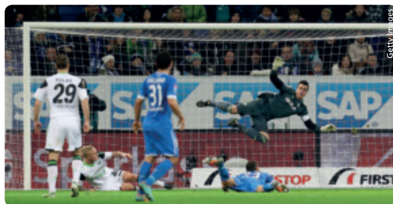
Diego Benaglio in action with his club, VfL Wolfsburg