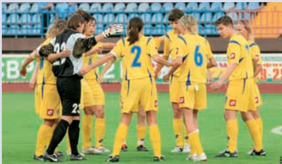
The development of women's football is one of the aims of the Ukrainian federation.

league managers starting the course in March and without fear of the financial burden the managers' enthusiasm has been evident. Former Wales international and current Manchester United star Ryan Giggs will attend the A licence course in the summer.