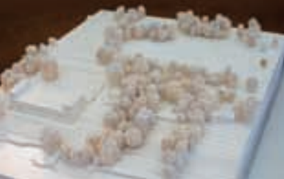
The model of the House of European Football and the project site.