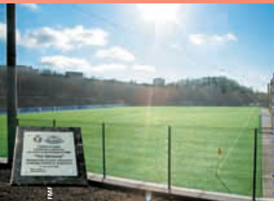
The mini-pitch installed at the technical university of Moldova.