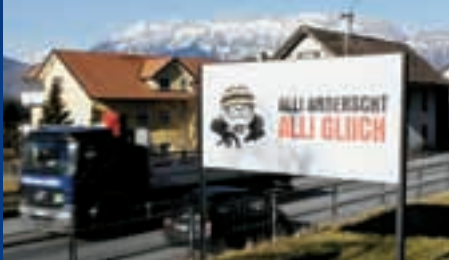
Posters generate publicity for the campaign.