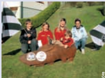
The youngest members of SV Spittal are not the only ones to enjoy their success.