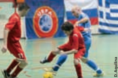
Malta (in red) in its first-ever qualifiers for the Futsal World Cup.