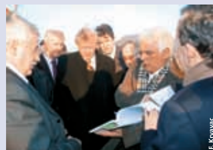
Visiting the site of the future centre.

"By visiting the city of Zenica, we wanted to support the best interests of football. UEFA finds that there is no better way to help the development of football than by building centres like this one, which is one of the most interesting projects we have been presented so far. This is the