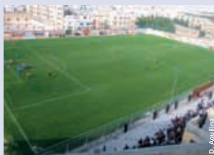
The Victor Tedesco stadium.

More than 30 clubs have applied to benefit from this UEFA-funded project, intended to assist the clubs. The installation of artificial lighting at the Hibernians