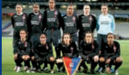
Olympique Lyonnais before their meeting with LFC Arsenal.