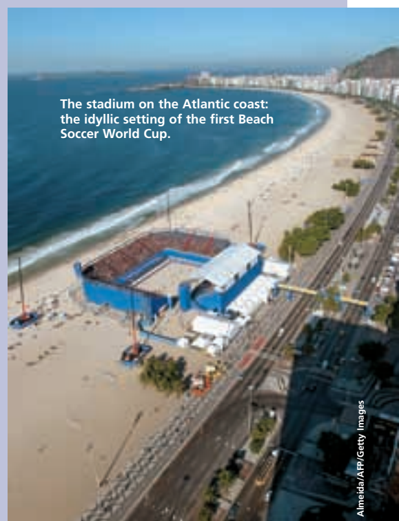
The stadium on the Atlantic coast: the idyllic setting of the first Beach Soccer World Cup.

European qualification for the FIFA World Cup is currently organised via the EBSL competitions.