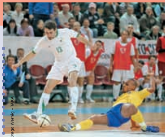
The arrival of the Brazilian team gave a fresh boost to Slovenian futsal.

The Slovenian team used these matches as preparation for the Futsal World Cup qualifiers, which took place at