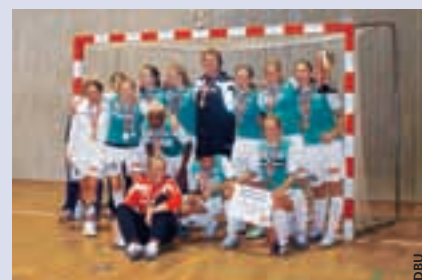
Fortuna Hjørring, winners of the women's futsal trophy.