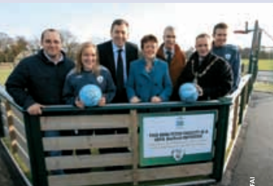
Technical director of the FAI, Packie Bonner, with members of Sligo Borough Council at the inauguration of a mini-pitch.

The Football Association of Ireland, in conjunction with local government authorities and the Department of Arts, Sport and Tourism, has launched over 30 mini-pitches throughout Ireland.