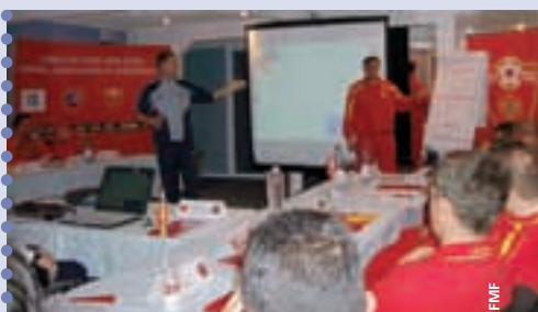
Coaching course in Tivat.