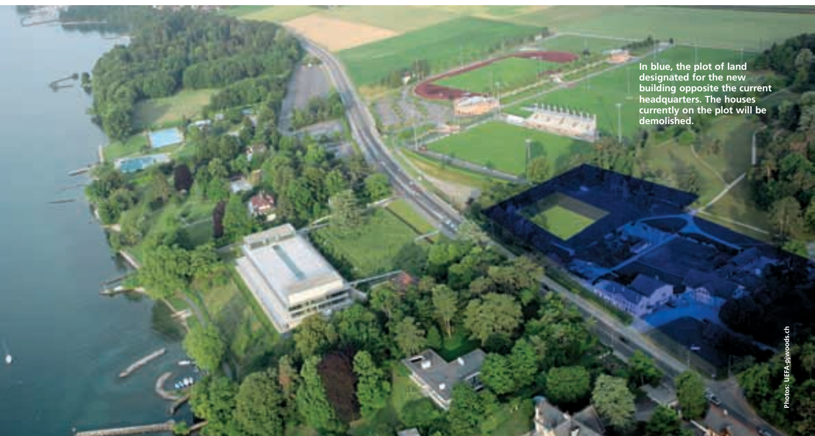
In blue, the plot of land designated for the new building opposite the current headquarters. The houses currently on the plot will be demolished.

Six different avenues were explored before the project on the grounds of the La Métairie clinic was retained. Acquiring the site was no mean feat. Studies were carried out