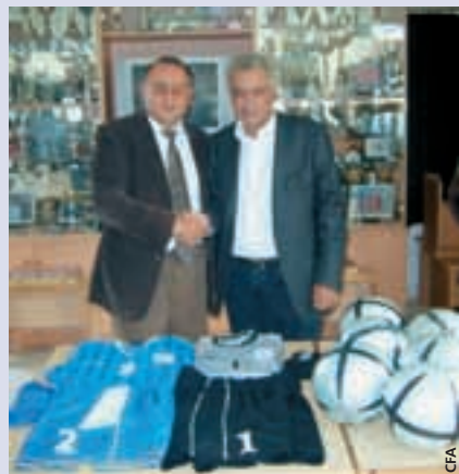
Delivering sports equipment for the state central prison team.

In cooperation with the Cypriot Coaches Union, the Cyprus FA coaching school also organised a coaching seminar on modern football tactics in Nicosia. This