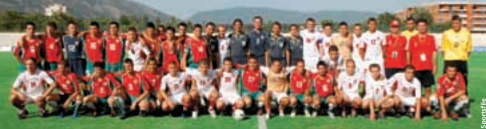
The 2007 finalists pose together before kick-off: the Regions' Cup is a celebration of friendship.