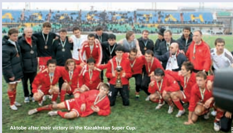
Aktobe after their victory in the Kazakhstan Super Cup.