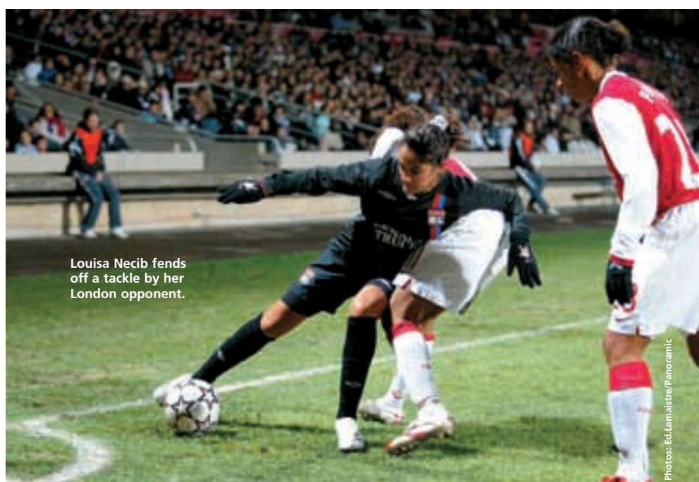
Louisa Necib fends off a tackle by her London opponent.

■ The other semi-final is between 1. FFC Frankfurt and CF Bardolino Verona.