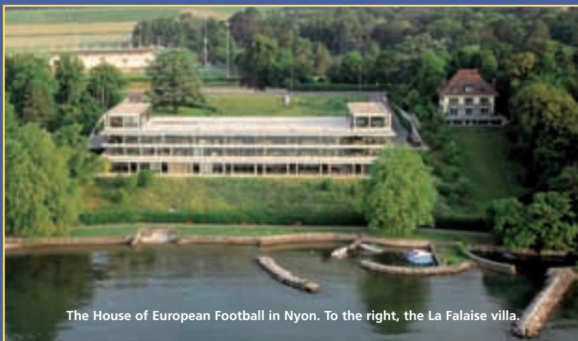
The House of European Football in Nyon. To the right, the La Falaise villa.