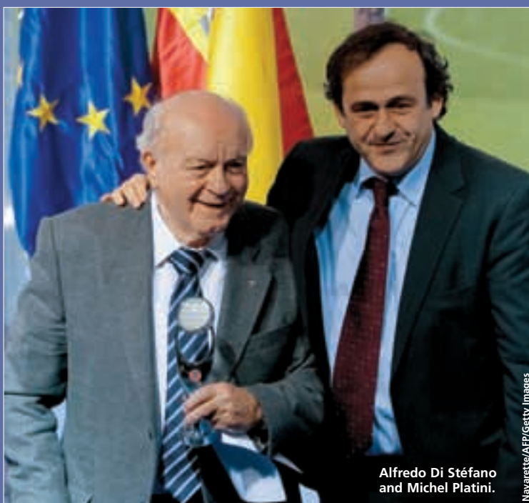
Alfredo Di Stéfano and Michel Platini.

The same day, a statue of Di Stéfano was unveiled at the stadium which carries his name in Valdebebas.