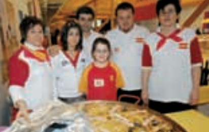
Dishes from all over Europe at the Sunday brunch.