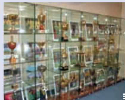
The trophy room at the new museum of Lithuanian football.