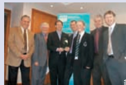
The IFA receives its award from the Royal National Institute of Blind People.

The Soccer Sight initiative put in place at Windsor Park has also allowed many →