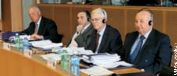
The Club Competitions Committee during its meeting in Nyon.