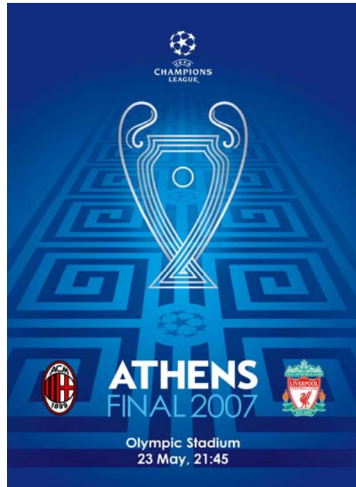
AC Milan – Liverpool FC 2-1