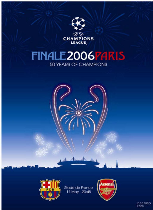
FC Barcelona – Arsenal FC 2-1