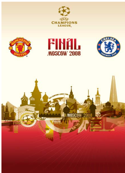
Manchester United FC – Chelsea FC 1-1 (6-5 pen.)