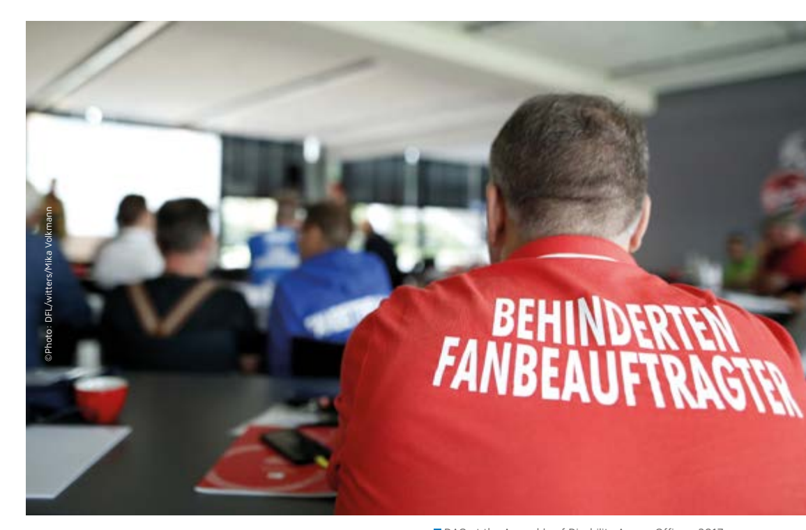
■ DAO at the Assembly of Disability Access Officers 2017, Cologne, Germany

The introduction of DAOs has changed the football landscape, producing an inclusive environment that reflects wider society. Article 35bis of the UEFA Club Licensing and Financial Fair Play Regulations has resulted in more disabled fans attending live matches, greater awareness of disability among football stakeholders and more disabled people taking their rightful place in the world of football – be it as spectators, players, volunteers, coaches, administrators or decision-makers.