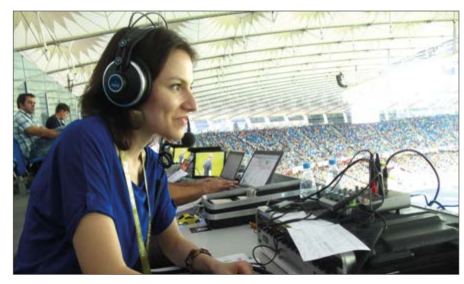
■ An audio-descriptive commentator at NSK Olimpiyskyi, Kyiv