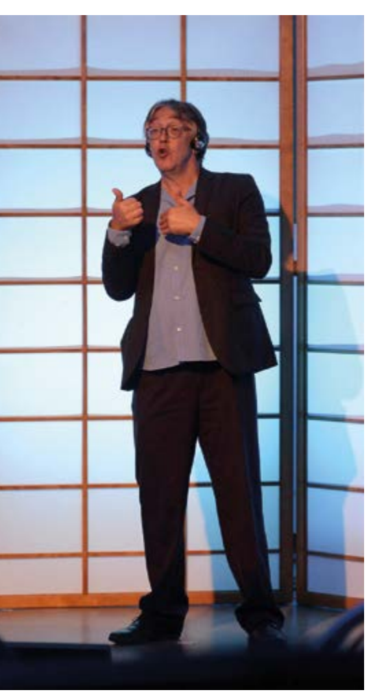
■ A sign language interpreter at the second International CAFE Conference in 2015