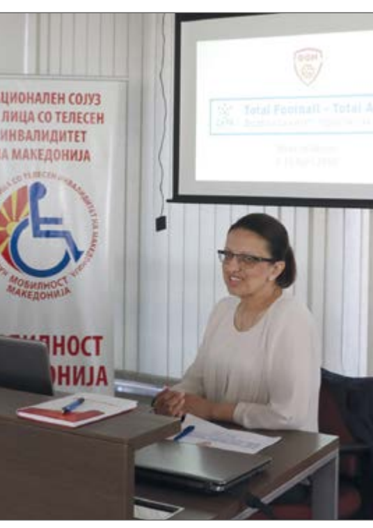
■ Speaker at DAO workshop organised by the Football Federation of FYR Macedonia

The DAO is responsible for informing and updating the national association / league's DAO coordinator regarding their club / stadium's accessible services and facilities on an annual basis.