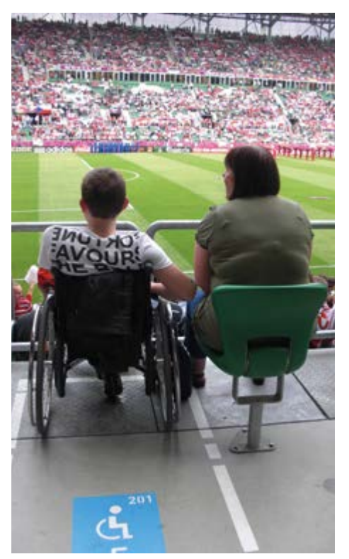
■ Wheelchair user space and adjacent companion seat with unobstructed sight lines at Municipal Stadium Wrocław