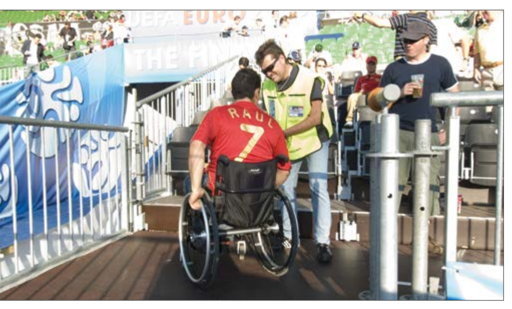
■ Steward speaking with wheelchair user, Ernst-Happel-Stadion, Vienna, UEFA EURO 2008 Final