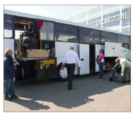
An accessible coach at Gelredome, Arnhem