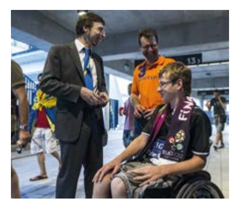
■ Wheelchair user at NSK Olimpiyskyi, Kviv, UFFA FURO 2012

The following pages describe some of the functions that a DAO will typically be expected to perform.