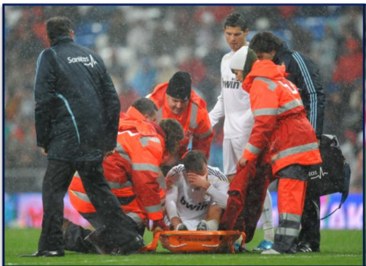
Pic 2: medical staff

In all competitions, it is a requirement that a stretcher team and a pitchside emergency doctor be available on matchday from at least the point at which the teams arrive at the stadium/hall until their departure.