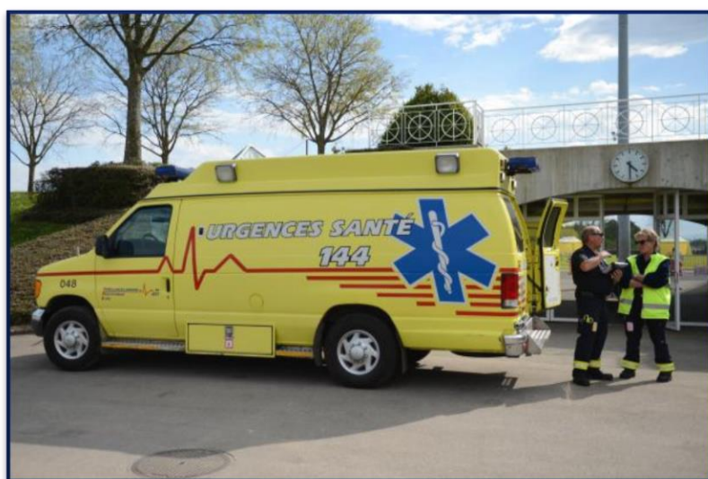
Pic 3: the ambulance

Where the referee trains some time before or after the start or finish time of the visiting team's MD-1 training session, it is for the host club/association to decide whether medical support will be provided. However, the host club/association should aim to provide suitable assistance wherever possible.