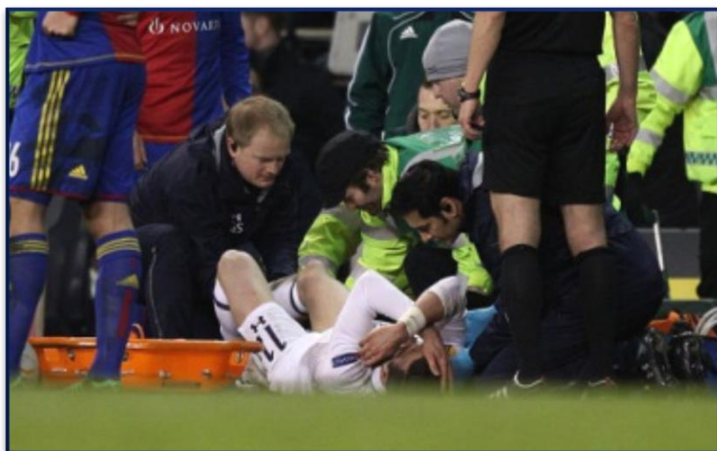
Pic 4: pitchside medical equipment

A: No. However, all items specified as being required at pitchside and all items specified as being required in the medical room must be provided. If the pitchside doctor chooses to have some of the medical room items with him/her at pitchside instead of keeping them in the medical room, this is acceptable, provided that this would in no way impair treatment of an injured player.