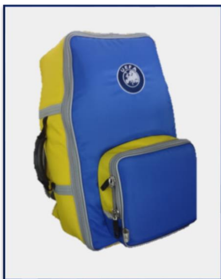
Pic 1: The emergency bag

In the event of queries relating to UEFA's Minimum Medical Requirements, please speak to the match delegate or contact the UEFA medical unit on +41 (0)22 707 2666 or send an email to medical@uefa.ch